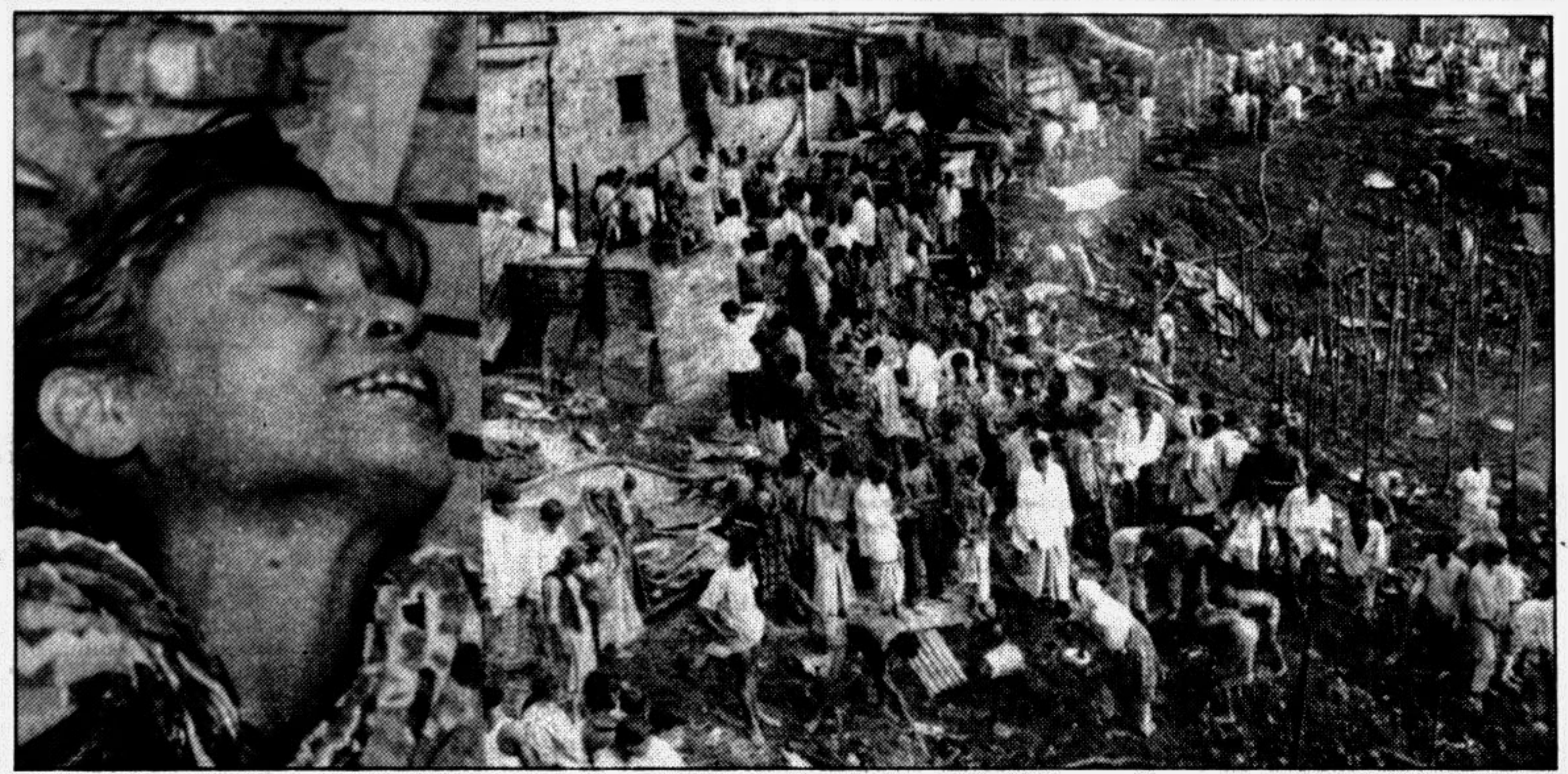
Right: Slum dwellers picking through the ashes after their slum in the city's Mohammadpur area was gutted in a fire yesterday. Left: An affected slum dweller wailing.

addressed the opening ceremony. Being held at the World Conference Centre at the Scottish capital, the meeting is being participated by the heads of government, including Bangladesh Prime Minister Sheikh Hasina. The sunny autumn afternoon echoed with a determined pledge by Commonwealth leaders representing all geographical regions and development strata of the present day world. The entire conference centre and its vicinity including the streets of Edinburgh was tastefully decorated by colourful banners, placards, festoons as well as national flags of Commonwealth countries which