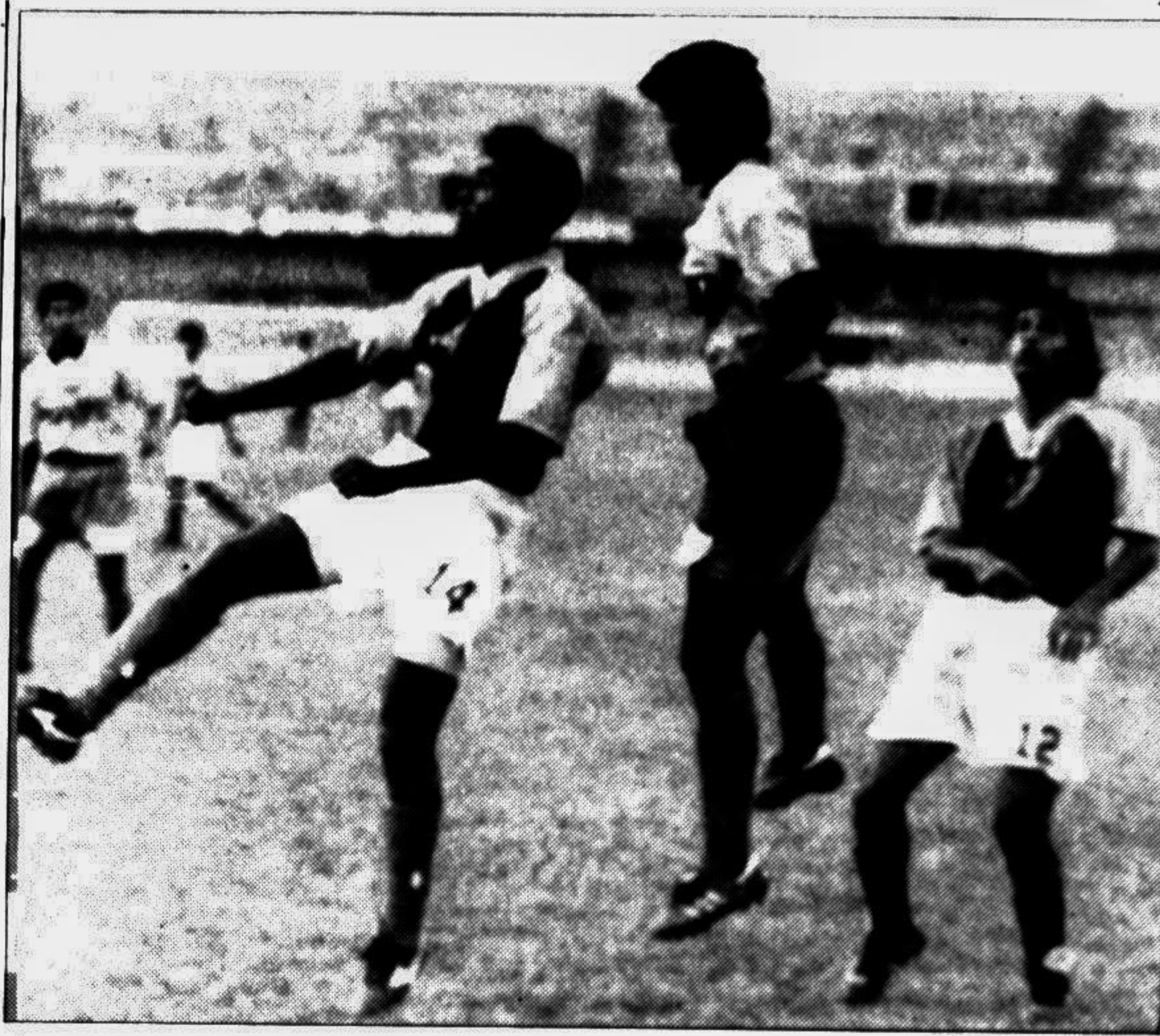
Action from yesterday's Premier Division football league encounter between Fakirpool and Rahmatganj at the Mirpur Stadium. The match ended goalless.