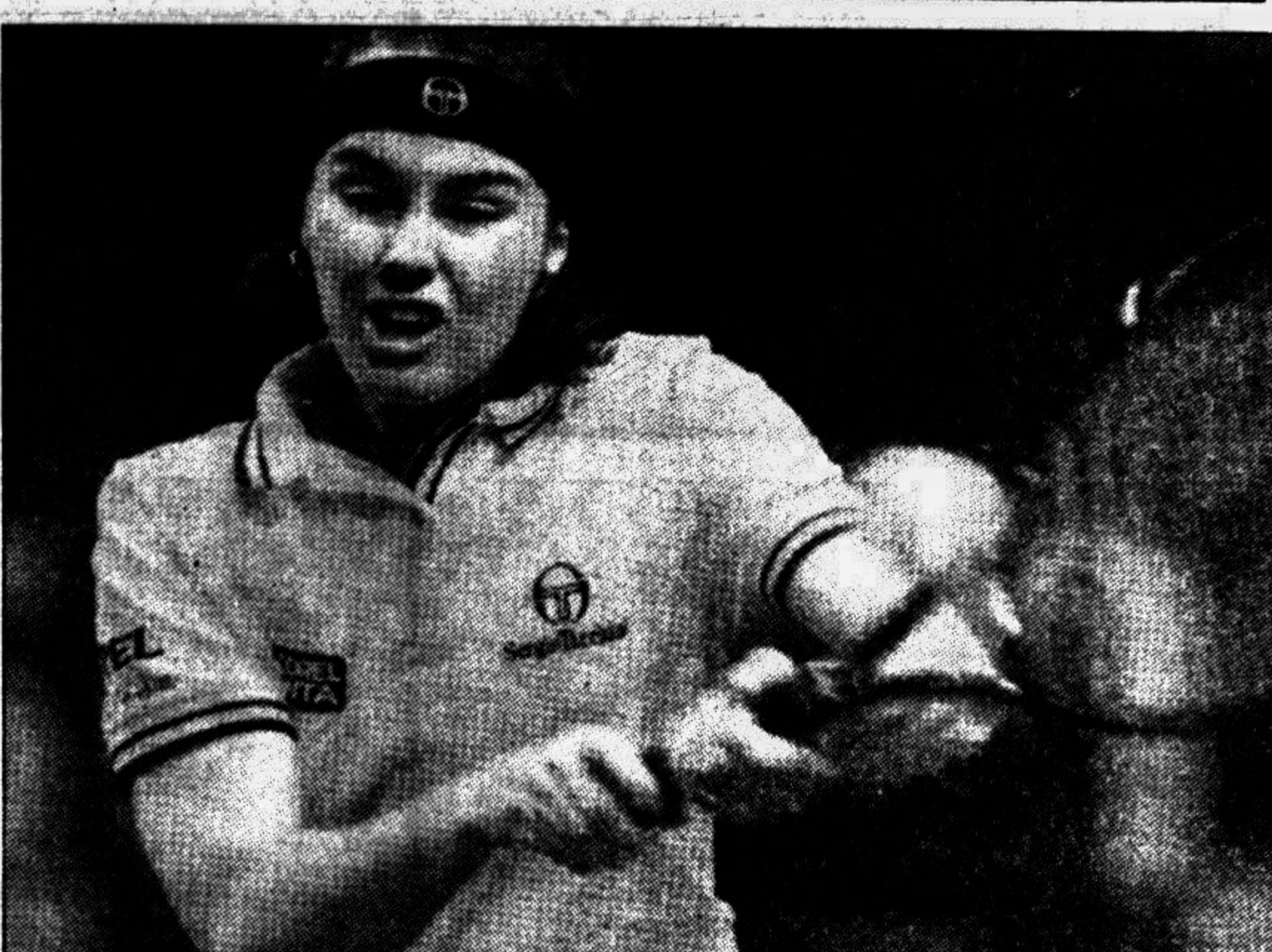
Swiss world number one Martina Hingis plays a double-fisted backhand against Anne-Gaëlle Sidot of France during their European Indoor championships engagement in Kloten, Switzerland on Wednesday.

Hartono, 48, is also eight-time All England badminton champion and coached Indonesia's team that won a gold medal at the 1992 Barcelona Olympic Games.