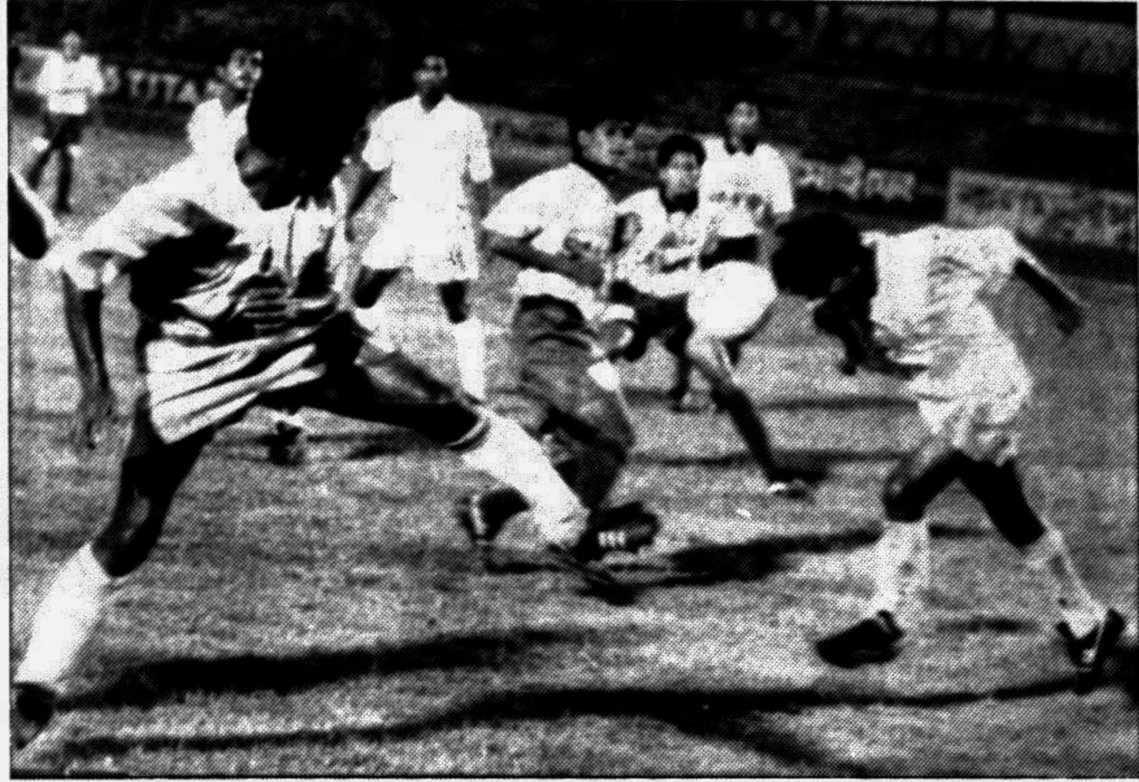
Action from Thursday's Premier Division football league encounter between Farashganj Sporting Club and Youngmen's Club Fakirerpool at the Mirpur Stadium. Farashganj won the match 2-0.