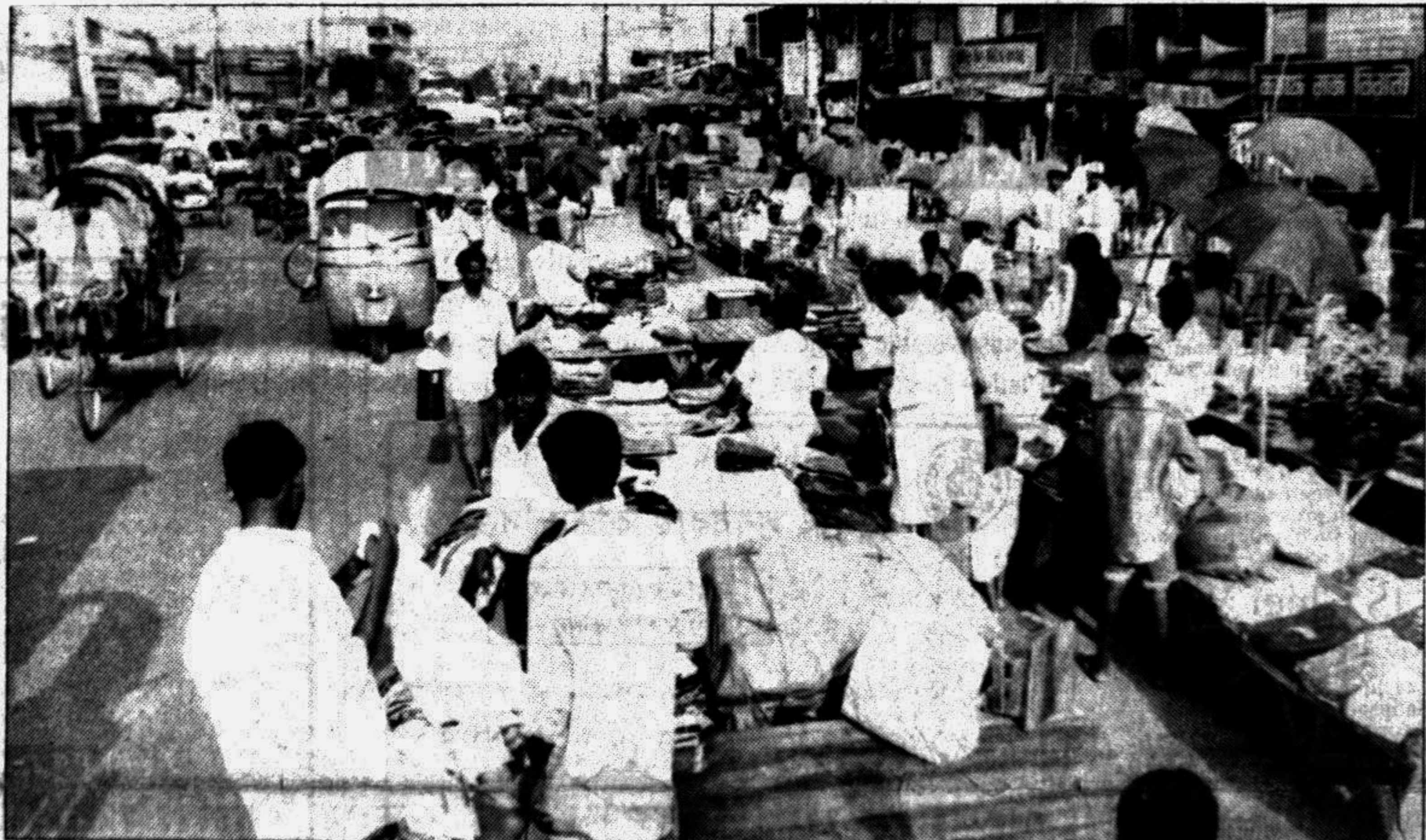
Vendors occupy almost half the road near Jatrabari crossing in the city, disrupting normal movement of vehicles.

NEW DELHI, Oct 16: Bangladesh today appealed to Interpol to make best use of its communication and intelligence system in tracing and arresting the fugitives involved in the assassination of Bangabandhu Sheikh Mujibur Rahman and four national leaders, reports BSS. Addressing the plenary of the 66th general assembly of Interpol here, the leader of the Bangladesh delegation and Inspector General of Police, Mohammad Azizul Huq, said the self-confessed killers of 1975 must face trial and be made accountable to the law of the land. He said that these self-proclaimed murderers were hiding in various parts of the world. Huq appreciated on behalf of the Bangladesh government to the Interpol for quick response See Page 12 Col 6