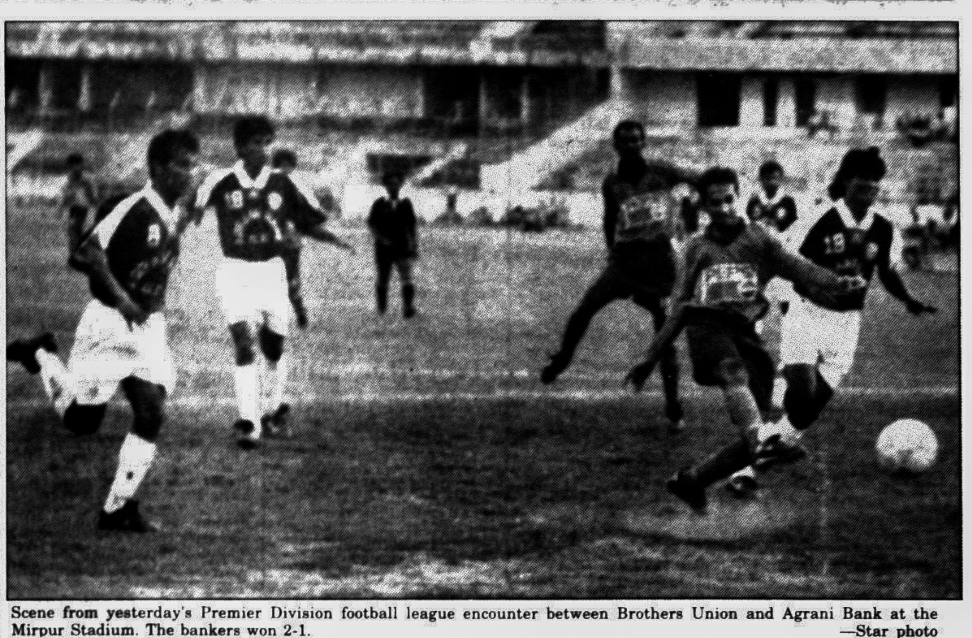
Scene from yesterday's Premier Division football league encounter between Brothers Union and Agrani Bank at the Mirpur Stadium. The bankers won 2-1.