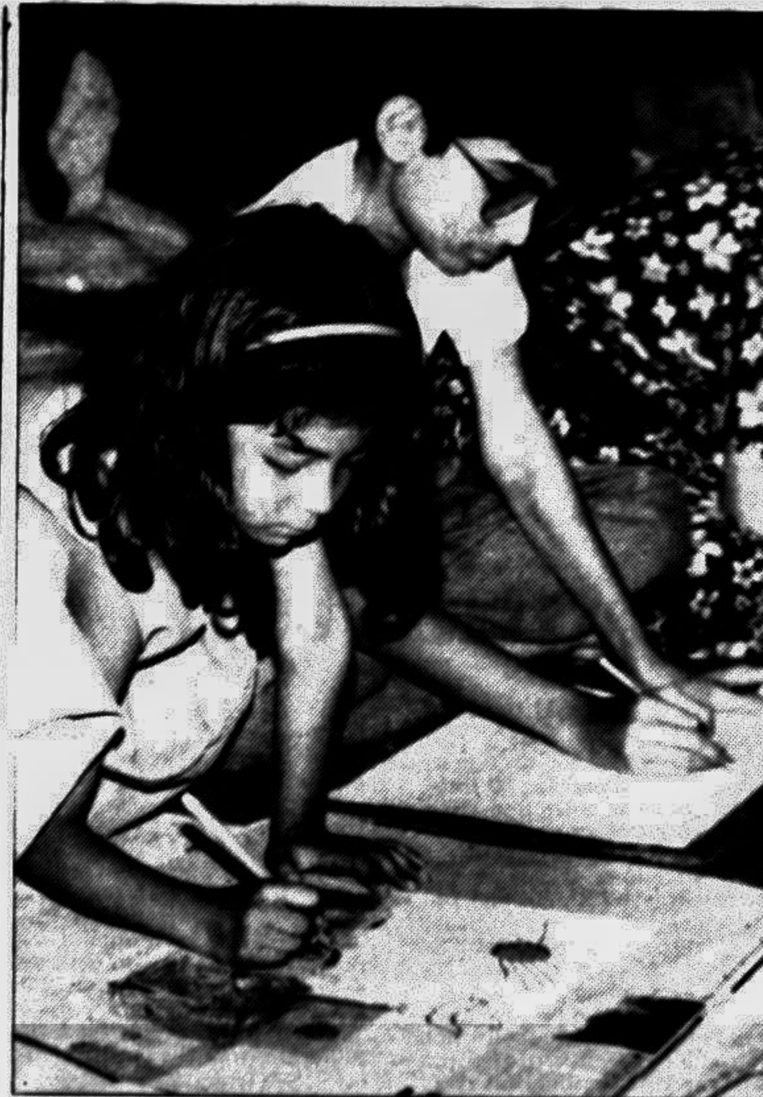
A children's painting competition was organised on the occasion of the founding anniversary of Jatiya Press Club on its premises yesterday.