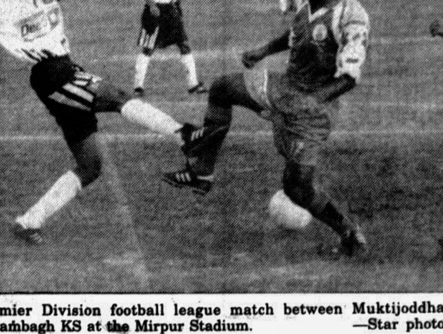
Action from yesterday's Premier Division football league match between Muktijodha Sangsad Krira Chakra and Arambagh KS at the Mirpur Stadium.