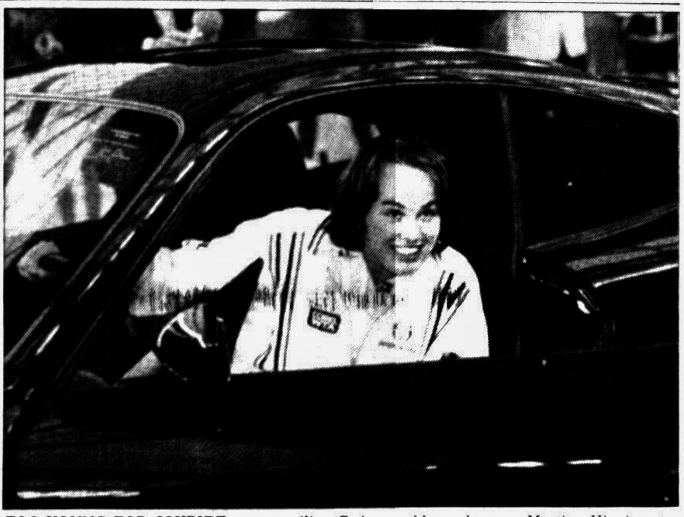
TOO YOUNG FOR JOYRIDE... a smiling Swiss world number one Martina Hingis gets into her Porsche car, which she won as the winner's prize at the WTA Grand Prix in Filderstadt, Germany on Oct 12. Hingis beat American Lisa Raymond 6-4, 6-2 in the final.