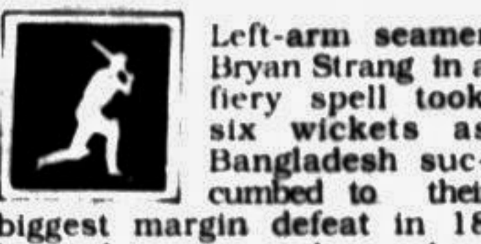
Left-arm seamer Brian Strang in a fiery spell took six wickets as Bangladesh succumbed to their biggest margin defeat in 18 limited-over matches when Zimbabwe thrashed them by 192 runs in their repeat clash of the three-nation President's Cup at the Aga Khan ground in Nairobi yesterday.