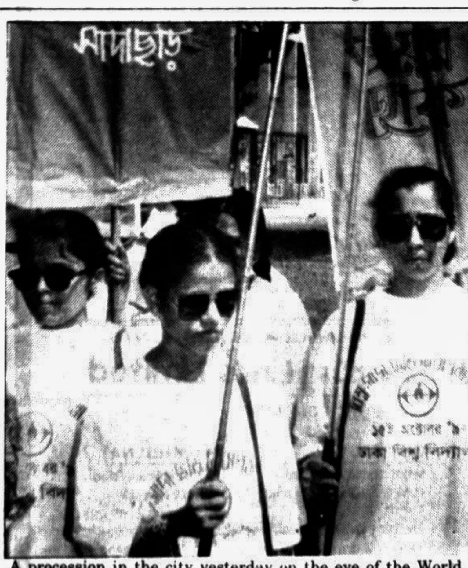
A procession in the city yesterday on the eve of the World White Cane Safety Day today.

Different issues relating to border will be discussed at the conference, said an official handout.