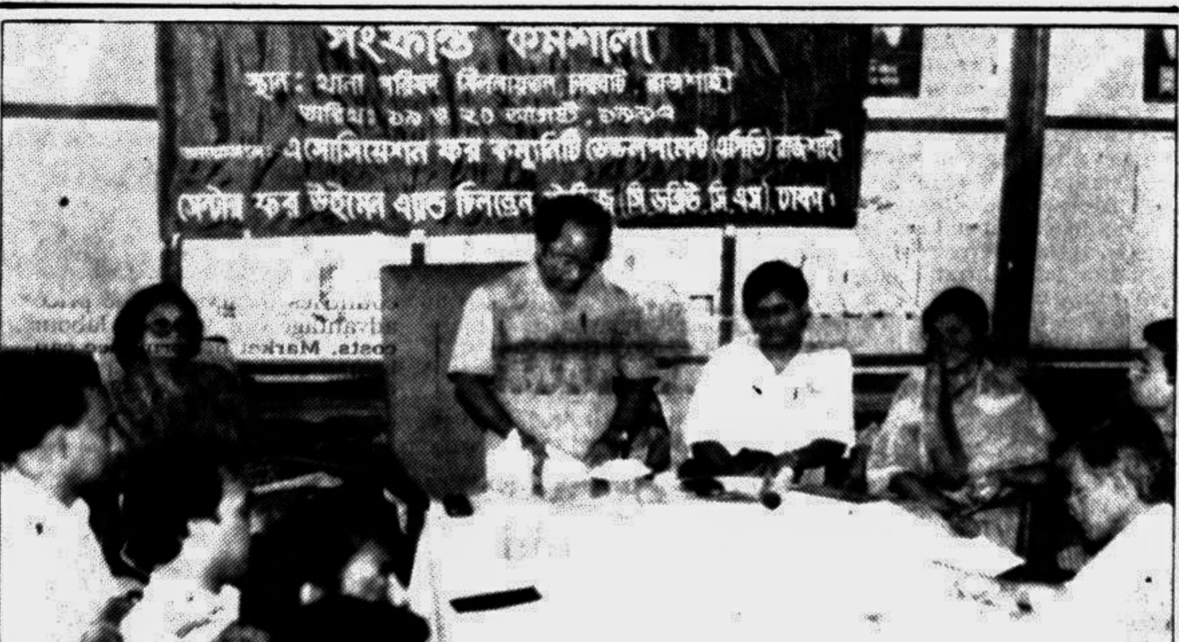
RAJSHAHI: A two-day workshop on 'Awareness Raising for Combatting Trafficking of Women and Children' arranged by Association for Community Development (ACD) concluded recently at Charchat auditorium in Rajshahi.

From Our Correspondent KHULNA-Patuakhali and Dhaka-Langalbandh. Luxury coaches of the abovementioned routes have been using the Asian Highway which runs through this district town.