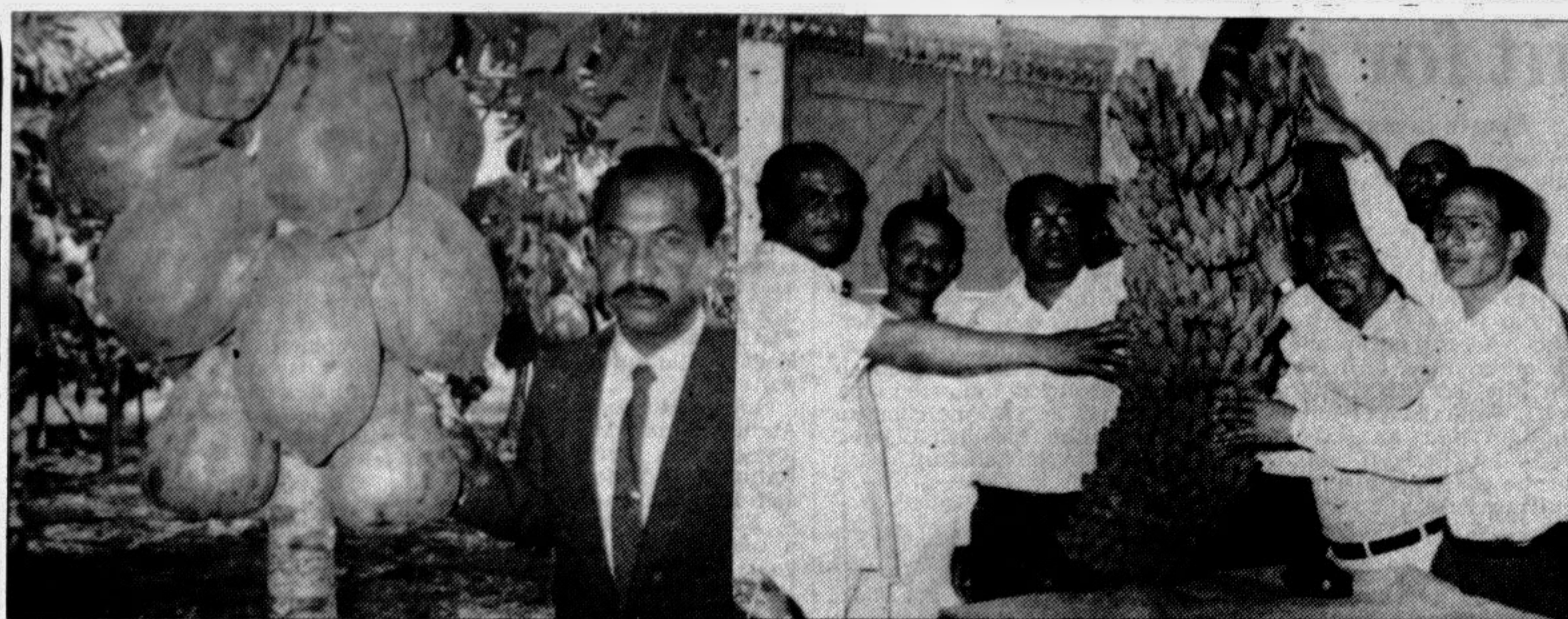
PABNA: Production of agricultural products has increased throughout the district recently due to application of modern methods. Photo shows some agriculturists displaying their produced items.

NARAYANGANJ, Oct 13: Bijoya Dashami marking the concluding day of the five-day long Durga Puja festival of the Hindu community was celebrated here with the immersion of the image of the goddess Durga in the river Shitalakya on Saturday evening, reports BSS.