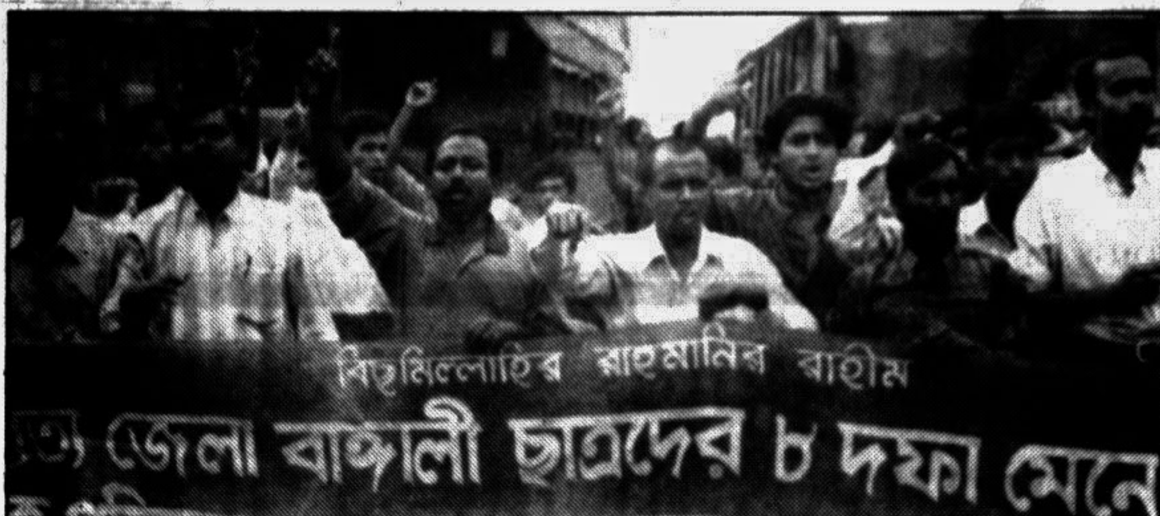
Parbatya Zilla Bangalee Chhatra Parishad brought out a procession in support of its various demands in the city yesterday.