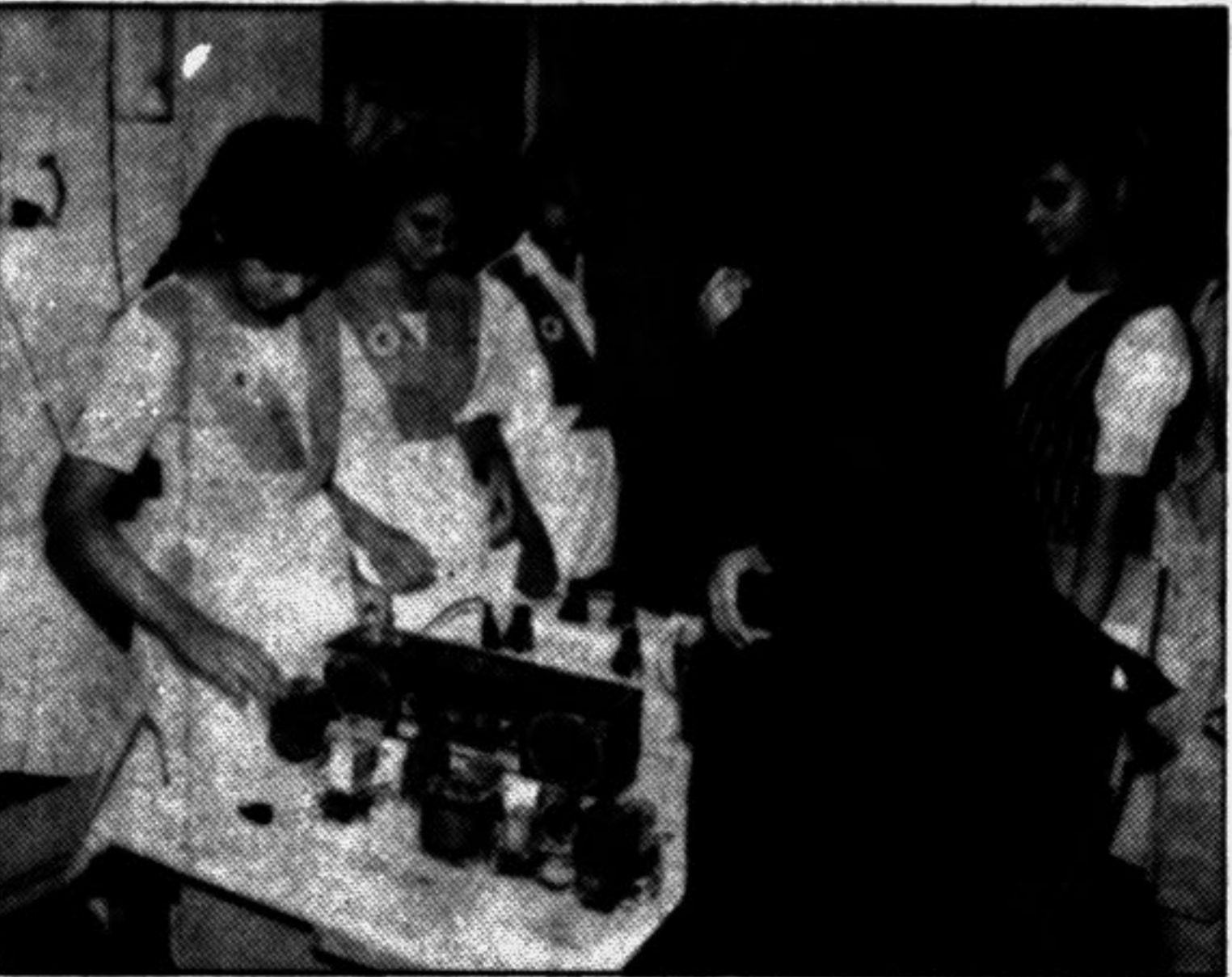
The annual science fair of Maple Leaf International School was held at the school premises in the city recently.