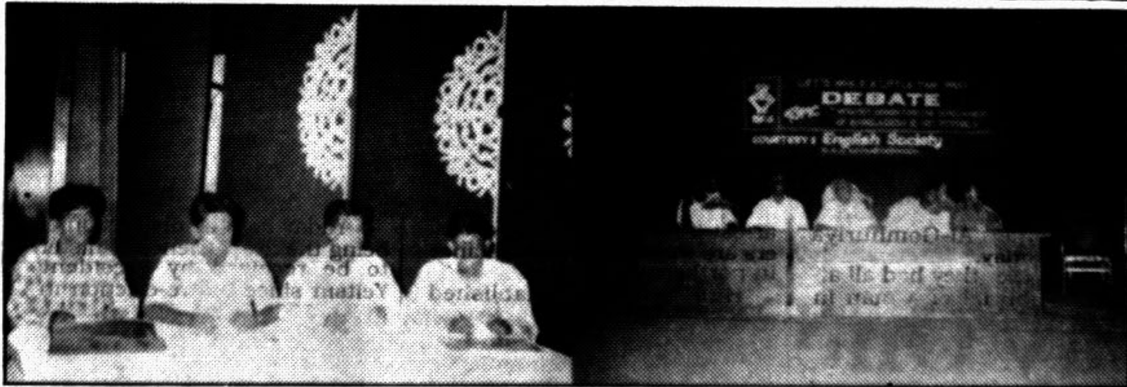
AGRI-VARSITY (Mymensingh): A debate competition arranged recently by BAU English Society progressing in the university campus.