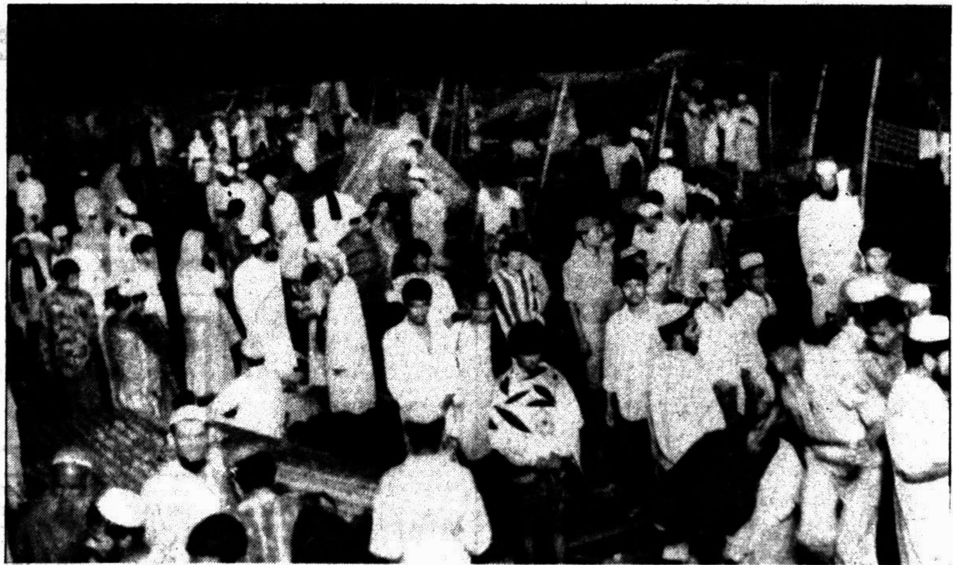
Devotees at the Ijtima ground in Tongi after the storm that razed the massive tin-shed pandal yesterday evening.

According to witnesses, the storm, bursting out of the gathering grey clouds on the north- See Page 12 Col 3