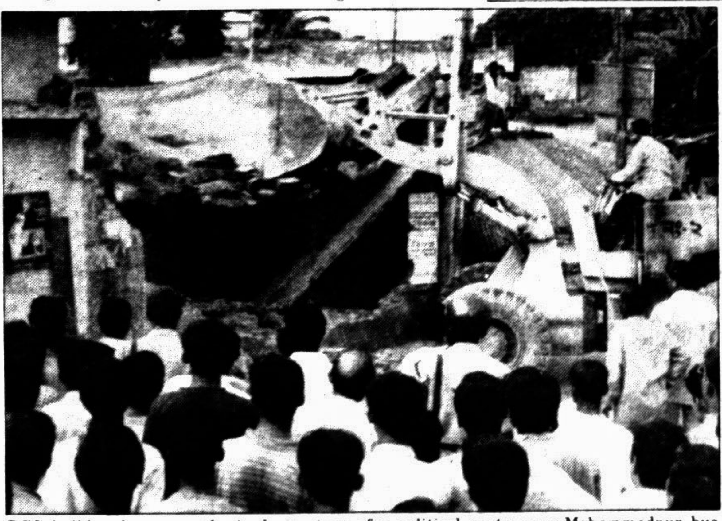
DCC bulldozed an unauthorized structure of a political party near Mohammadpur bus stand in the city yesterday.

The committee will study the Act and suggest necessary amendments for quick and effective disposal of the cases.