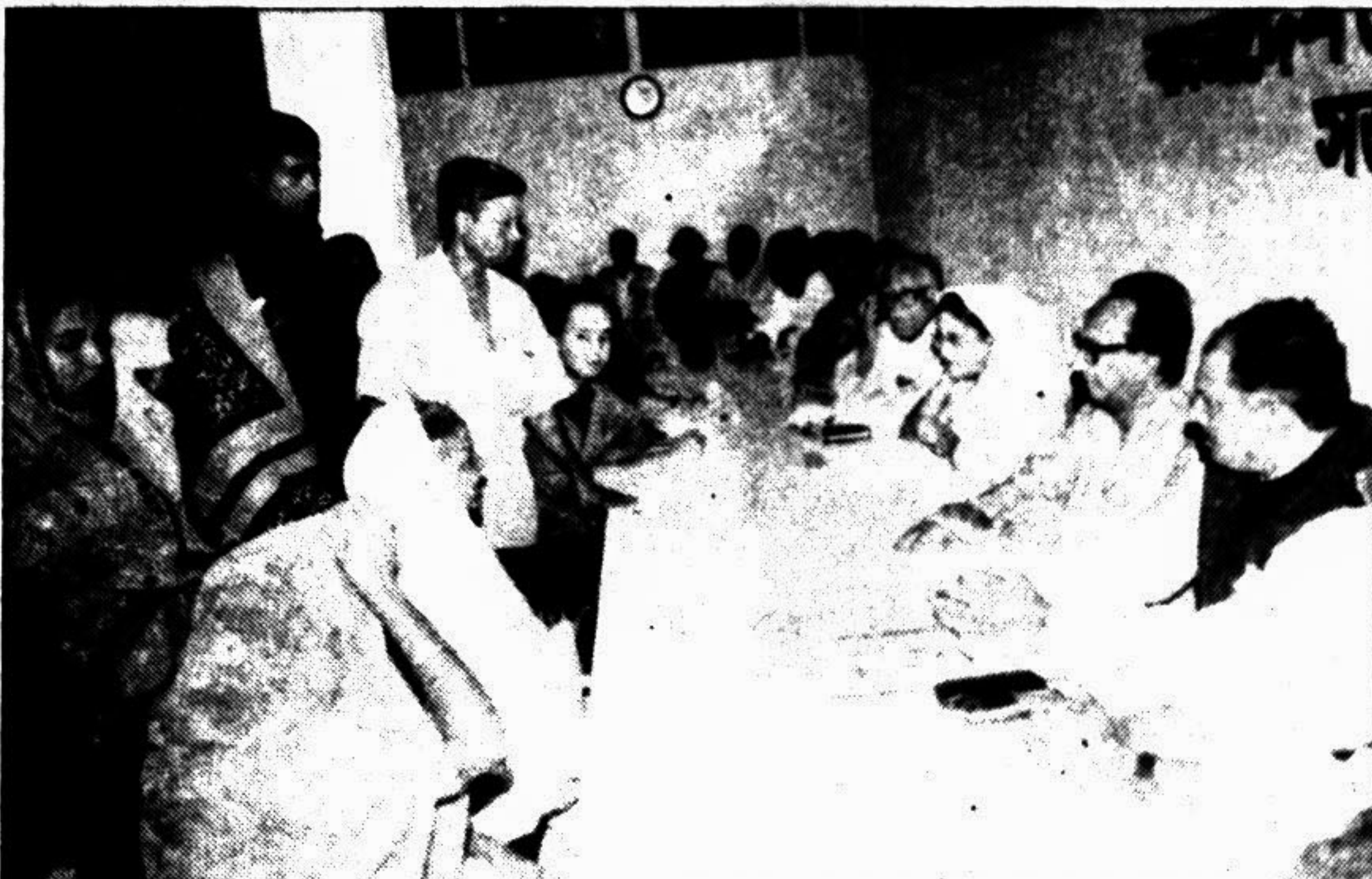
Prime Minister Sheikh Hasina listening to the problems of people from all walks of life at the Awami League central office in the city yesterday.