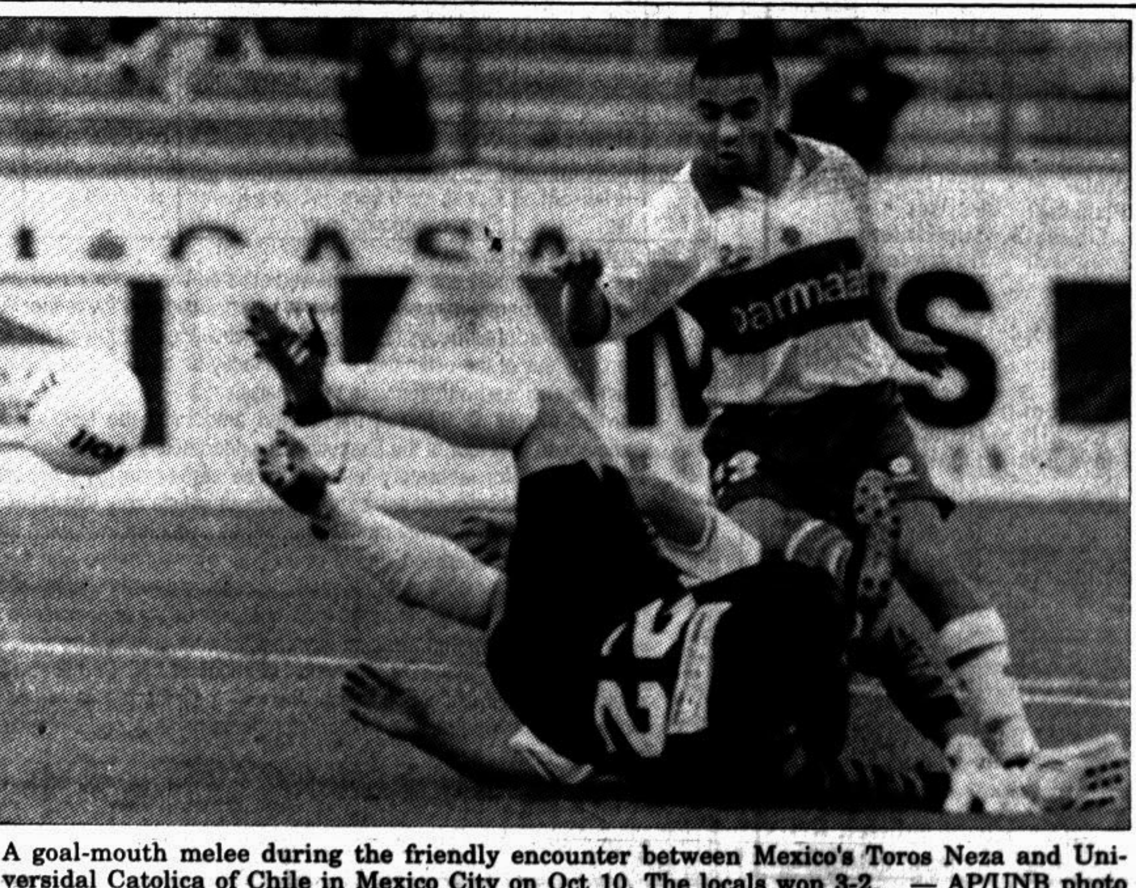
A goal-mouth melee during the friendly encounter between Mexico's Toros Neza and Universidad Catolica de Chile in Mexico City on Oct 10. The locals won 3-2.

Also out is American Jonathan Stark, the defending champion, who had beaten top seed Michael Chang in the first round.