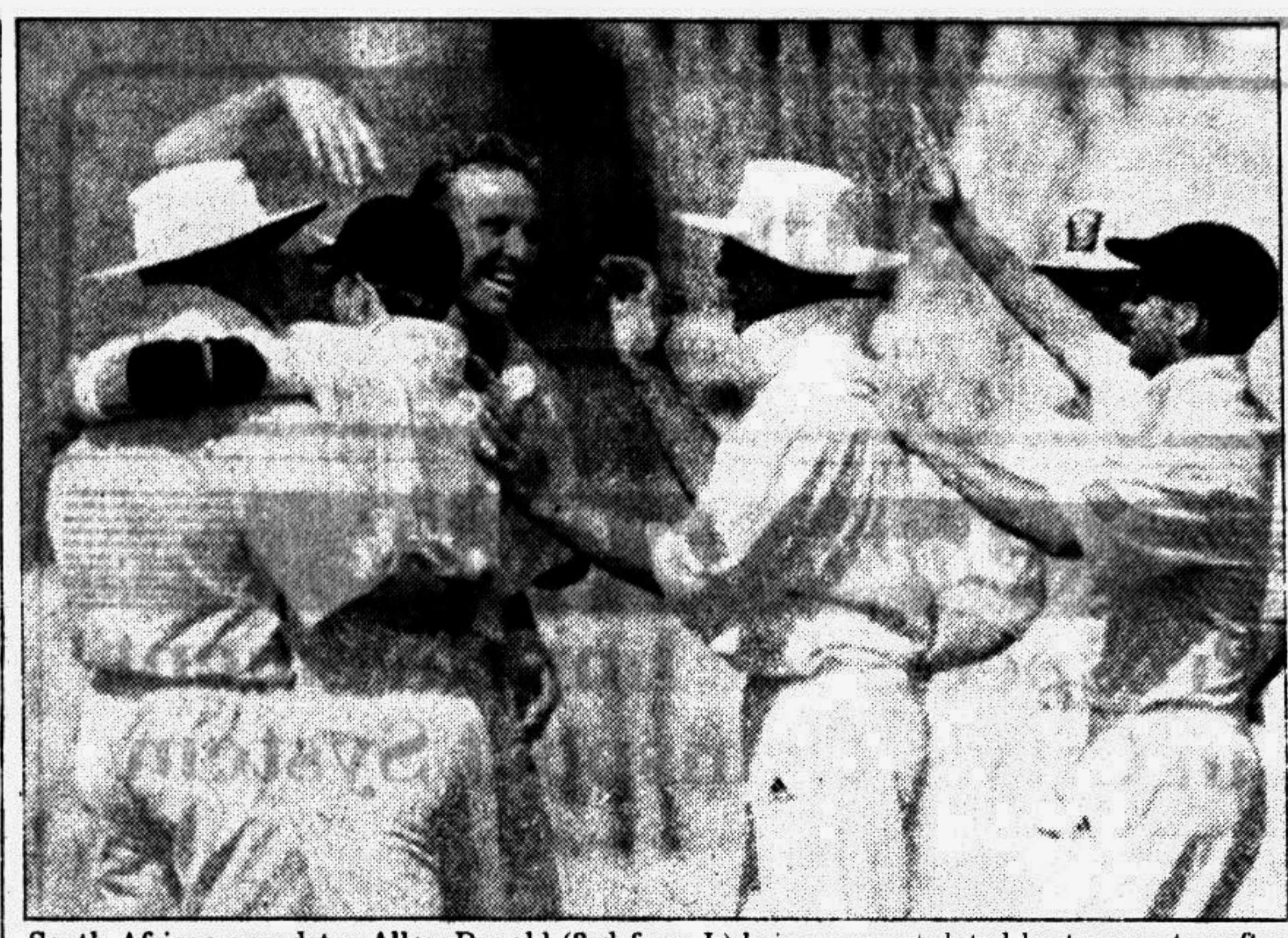
South African speedster Allan Donald (3rd from L) being congratulated by teammates after he dismissed Pakistani opener Saeed Anwar during the final day's play of the first Test in Rawalpindi on Friday. The match ended in a draw.

Morocco, who have already qualified for France next year, included six survivors from their 1994 World Cup squad but were missing players from local clubs Raja Casablanca and Royal Armed Forces, involved in African club competitions.