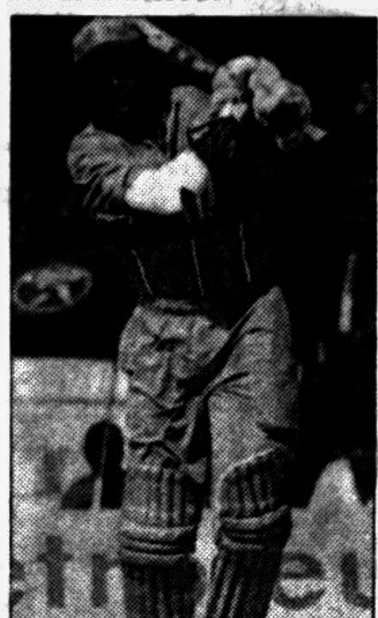
OTIENO ... 144

bowled by same bowler. Bangladesh will play their second match of the double-league tourney against Zimbabwe tomorrow.