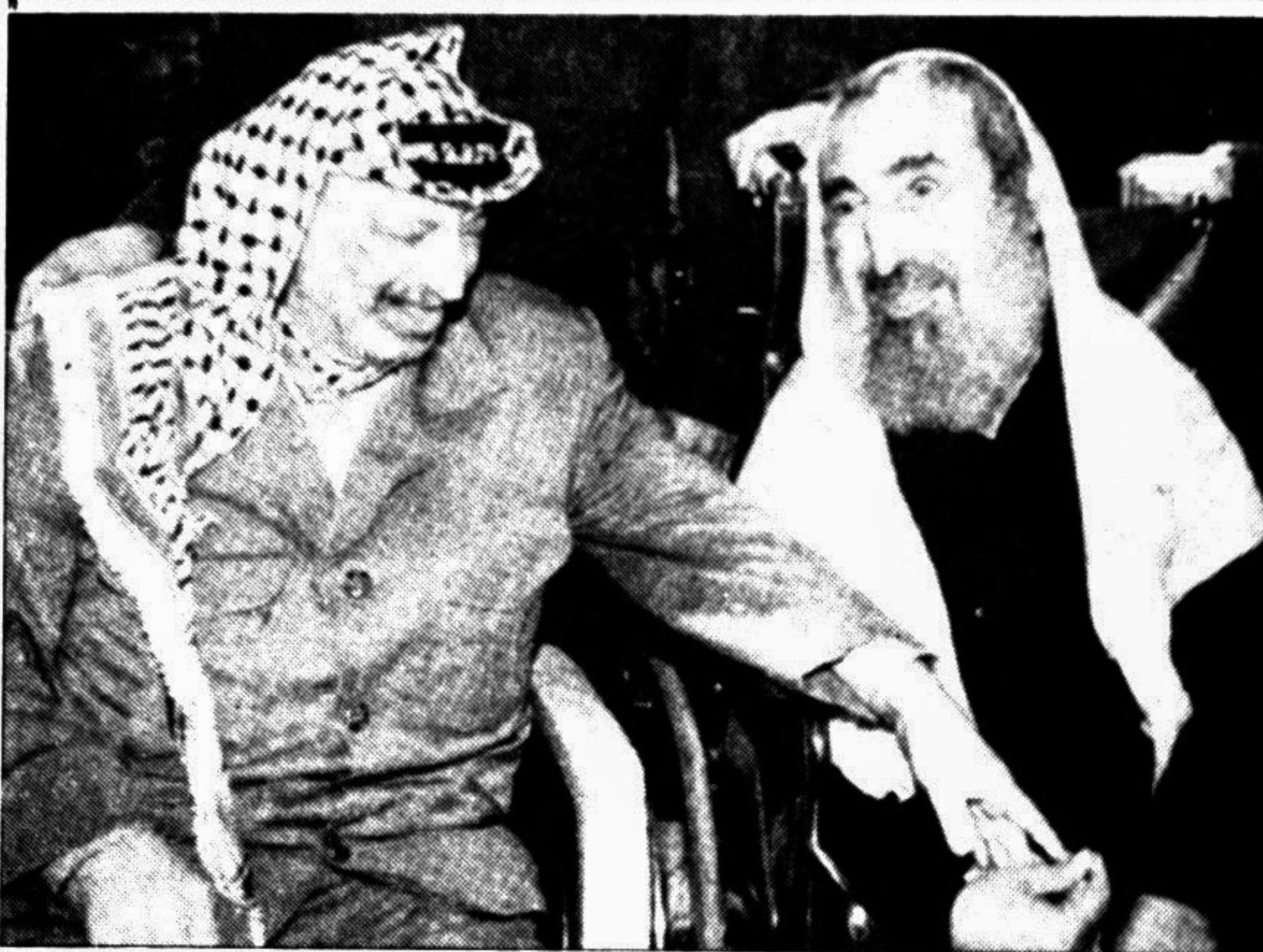
Palestinian President Yasser Arafat welcomes Hamas leader Sheikh Ahmed Yassin on his arrival at the Islamic complex sports club in Gaza City on Tuesday. Yassin arrived in Gaza on Monday from Jordan after being released from an Israeli prison last week.