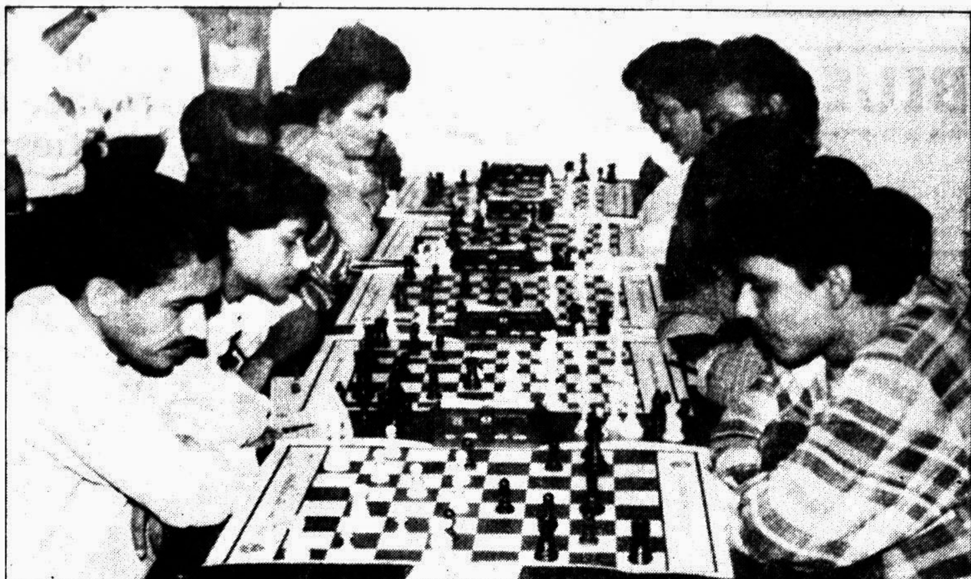
Scene from yesterday's Open FIDE rating chess tournament at the NSC.