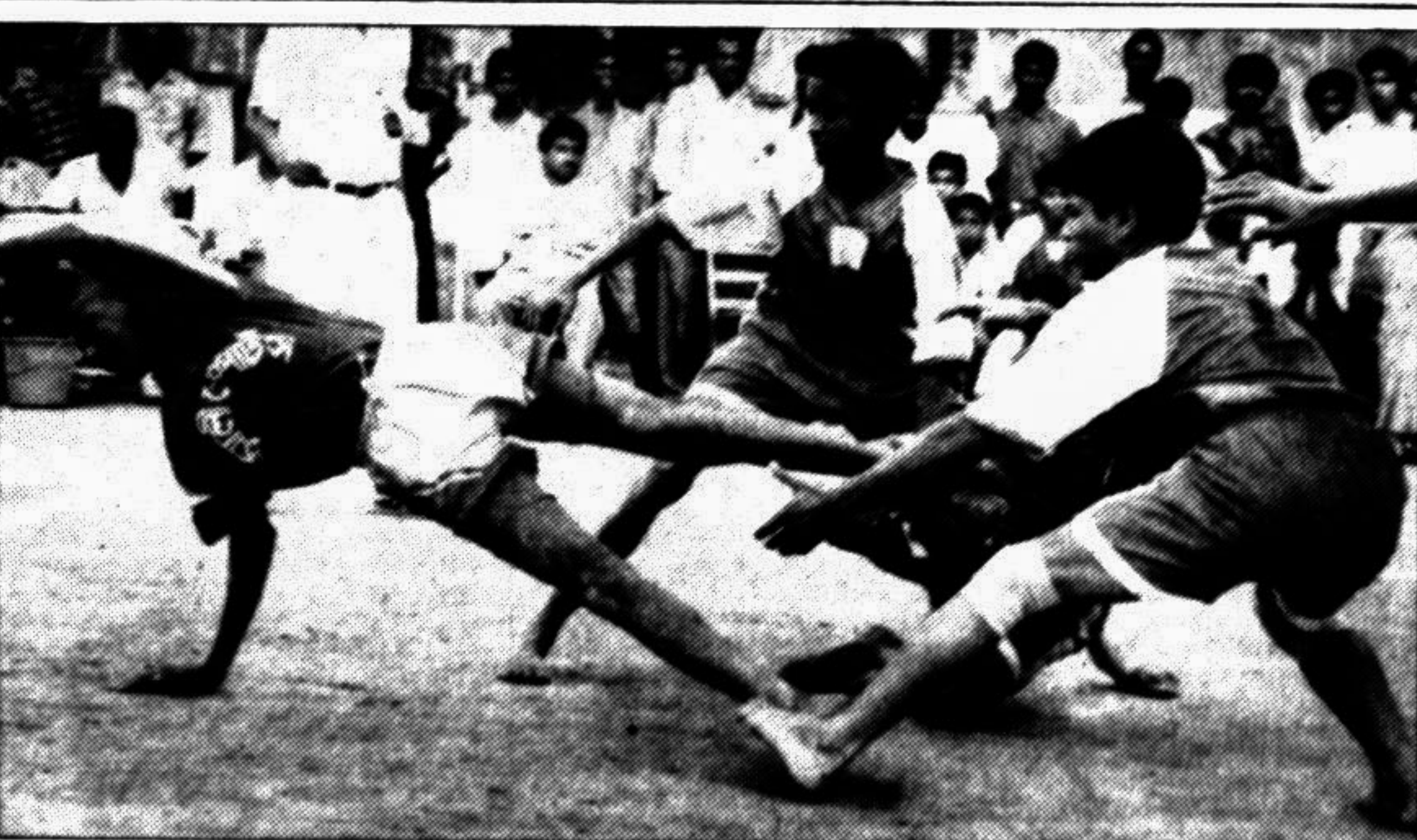
Action during the juvenile kabadi third-place decider between Sharmin Textile Mills High School and Maniknagar Model High School at the court next to Dhaka Stadium yesterday.