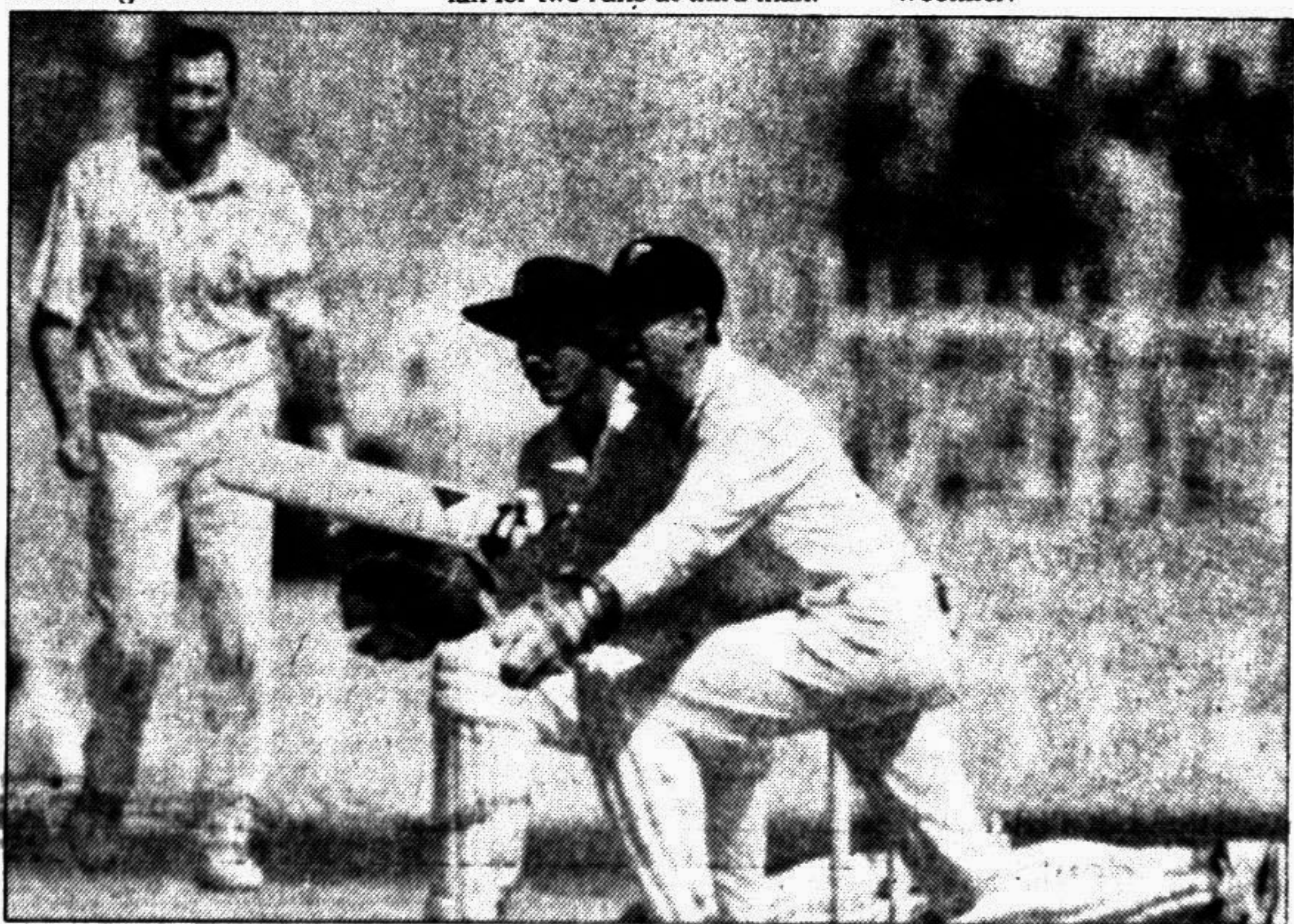
Azhar Mahmood of Pakistan sweeps South African Pat Symcox across the rope during the third day's play of the first Test in Rawalpindi yesterday.

"He will be flying home by the weekend. He consulted a specialist in Karachi last evening and has been advised complete rest for three weeks," said South Africa coach Bob Woolmer.