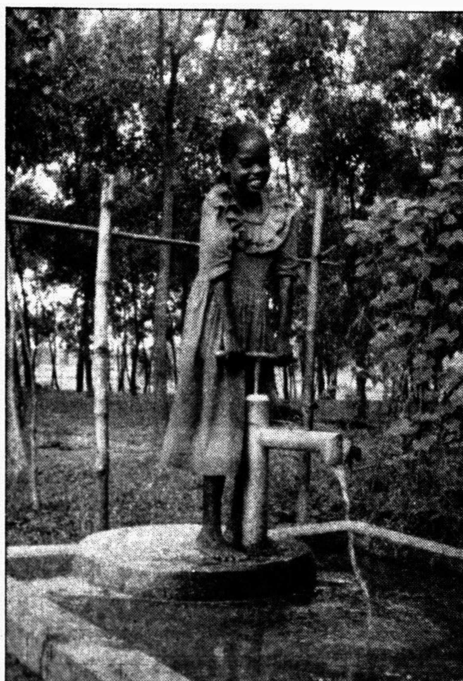
Tara tubewell: Easy water now, and the surrounding is getting greener too, but can it be sustained in the long run?

Pressure on underground water is dangerously increasing. Unless some initiatives are taken to hold the monsoon waters in reservoirs to use in dry season irrigation, soon even the technologically advanced Tara tubewells will be rendered ineffective ... And not only supply of water but also sanitation of the community should be ensured ... Otherwise the dream of developing our main resource — Manpower — may not be realised.