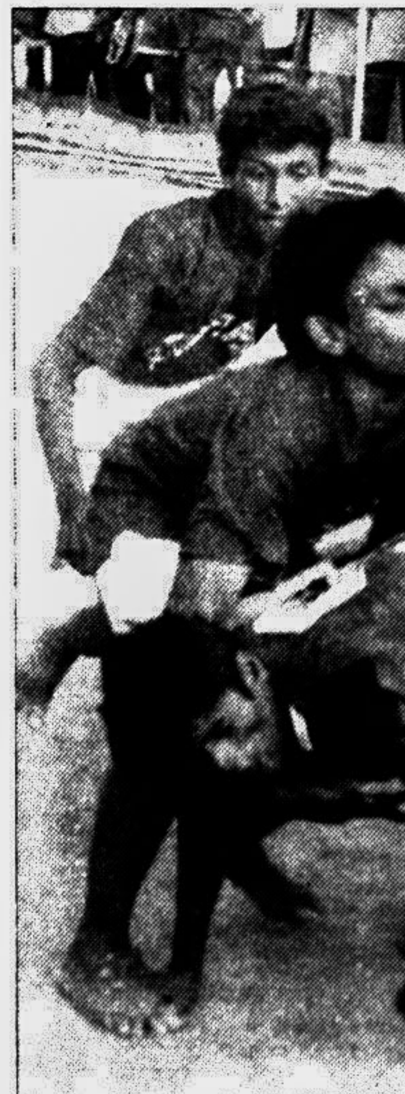
Action from yesterday's juvenile kabadi encounter between Razorbagh Police Lines High School and Nawabpur Govt High School at the court near Dhaka Stadium.

TODAY'S MATCHES Sharmin Textiles Mills High School vs Ansar & VDP High School (4 pm) Shaheed Nabi High School vs Maniknagar Model High School (4.45 pm).