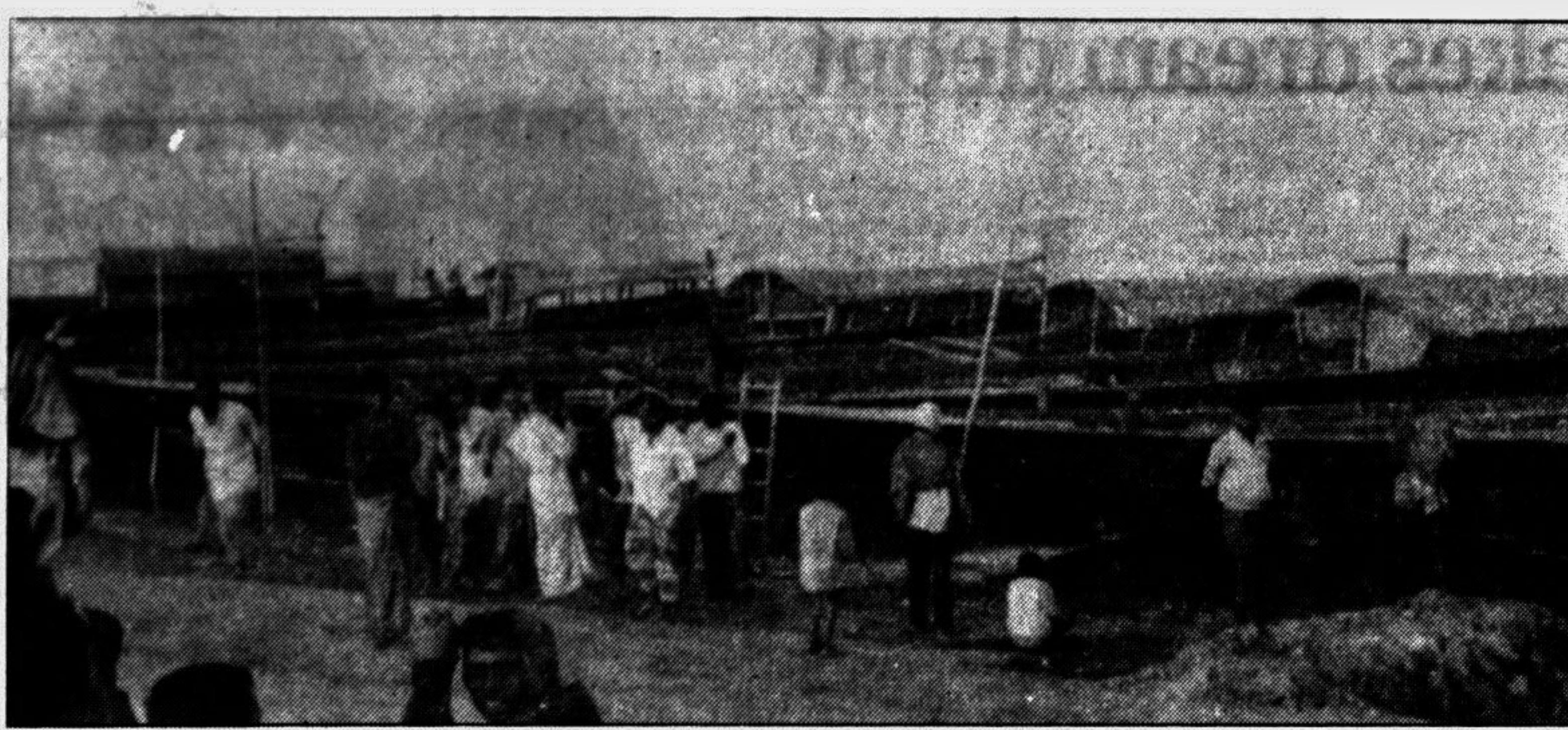
GAIBANDHA: Hundreds of engine operated big country boats have been plying to and from Balashi ghat and other places. The old ghat will be shifted due to sharp fall in water level from Teestamukh ghat to Balashi ghat.

Police sources said the clash ensued when a group of people tried to enter the circus pandal without ticket. On receiving information police rushed to the spot and brought the situation under control by resorting to baton charges. A case was filed with the police in this connection.