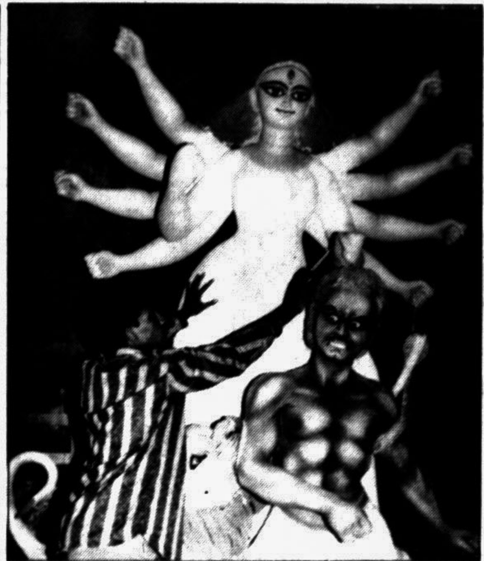
Preparations are going on for Durga Puja, the biggest religious festival of the Hindus.

Union leaders think that the Task Force was formed to give 'golden handshake' to at least 10 per cent of the total employees. But it was denied by Ibrahim Jamaluddin, however, threatened to launch an agitation programme if there was any such move behind formation of the Task Force.