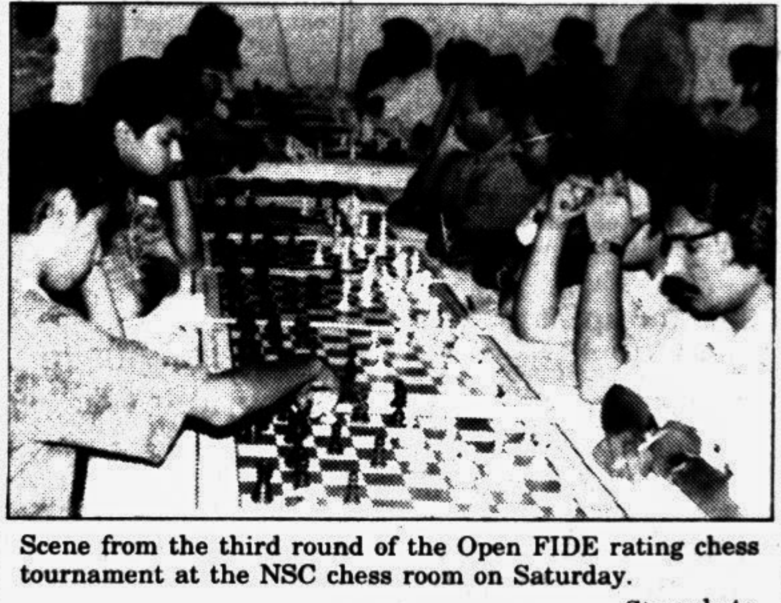
Scene from the third round of the Open FIDE rating chess tournament at the NSC chess room on Saturday.

HARARE, Oct 4: A perfectly-paced fourth wicket partnership of 123 between Gavin Renne and skipper Alistair Campbell carried Zimbabwe to a three-wicket victory over New Zealand in the second one-day international today, report agencies.