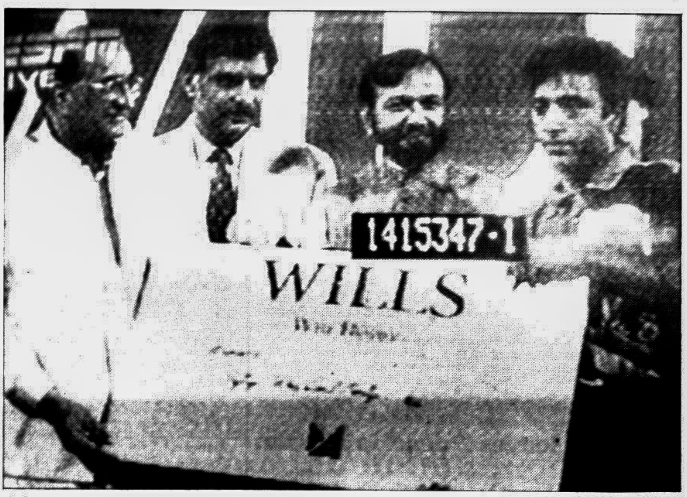
A beaming Pakistan skipper Saeed Anwar collecting the winners' cheque after the home team clinched the three-match series 2-1 defeating arch-rivals India in the final encounter by nine wickets in Lahore yesterday.

He said: "This will be a better fight than the one with Collins."