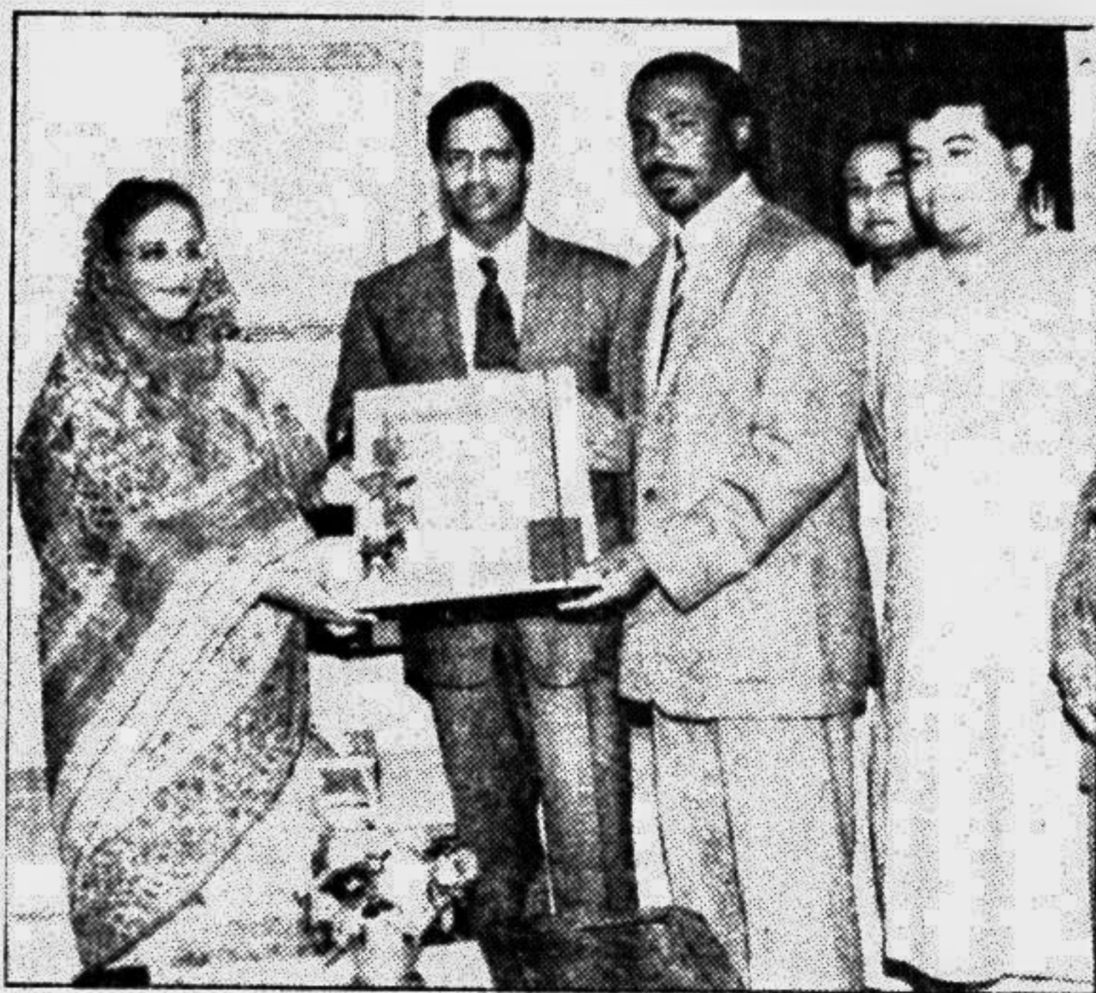
Prime Minister Sheikh Hasina handing over the honorary citizenship certificate to Gordon Greenidge, Coach of the National Cricket team, at her office yesterday.

Gordon Greenidge, the West Indian coach who helped elevate Bangladesh cricket to world status, was conferred honorary citizenship of Bangladesh, report agencies. Greenidge is the second recipient of such honorary citizenship after heavyweight boxing legend Mohammad Ali while National poet Kazi Nazrul Islam was given regular citizenship of Bangladesh. Prime Minister Sheikh Hasina handed over the citizenship certificate and passport to the Caribbean cricketer at a simple ceremony at her office yesterday. "It's a prestige and great honour for me," said Greenidge while receiving the certificate. He was all praise for such noble gesture from the government in recognition to his contribution. "I will display this green passport throughout the world wherever I go," he said. Hasina declared honouring Greenidge with the citizenship helped Bangladesh National Cricket team lift the ICC Cup and qualify for the 1999 Eng- See Page 8 Col 8