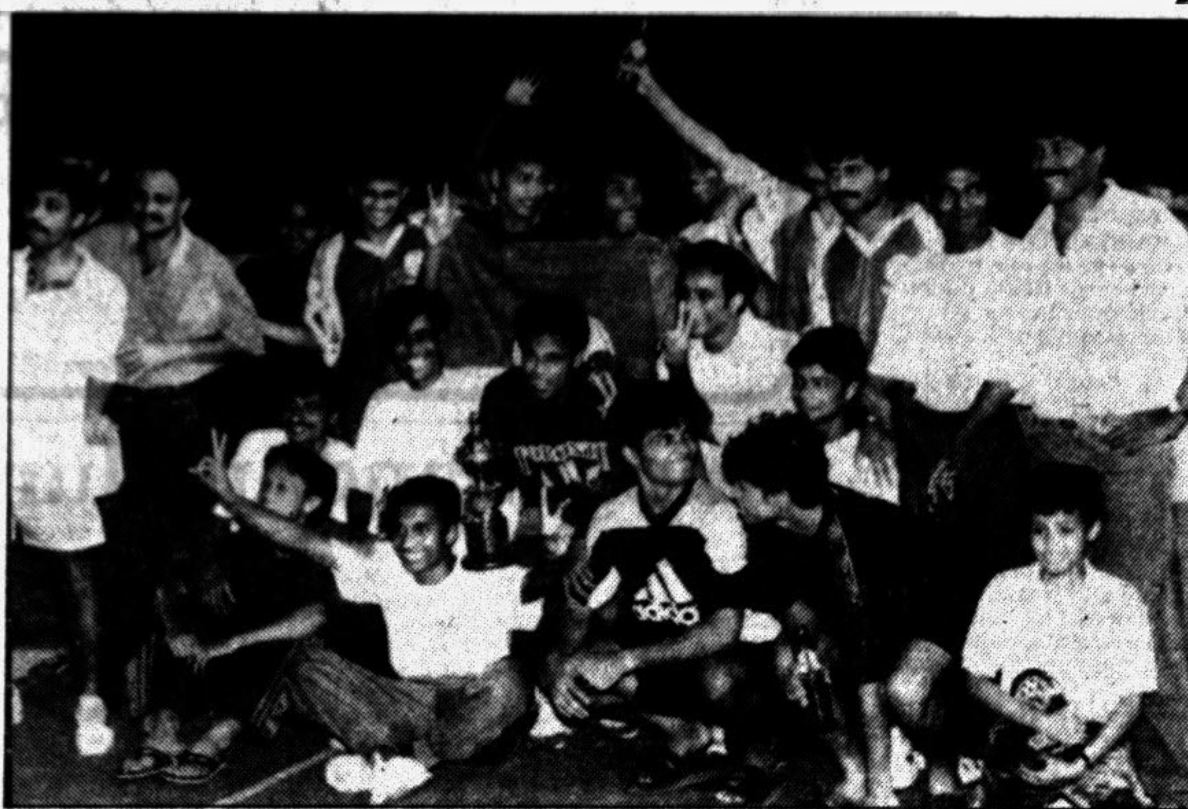
The jubilant players and officials of the Muktiyoddha Sangsad Kriya Chakra.