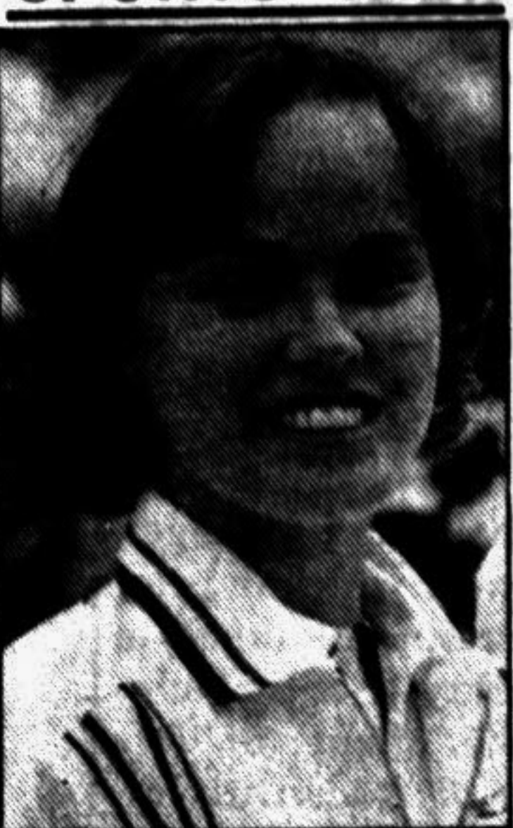
Martina Hingis (World No 1 tennis player) I am very happy about my whole game. I just had a great year. You know, what can I improve? Sometimes I ask myself, it's a little scary. After winning the US Open title.

COMPETITION FOR SCHOOL CHILDREN Competition-79