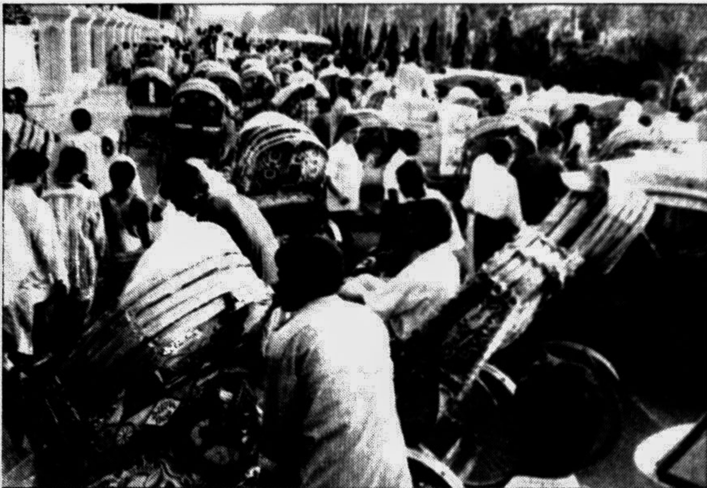
Traffic jam on the street in front of Rajuk Bhaban during the public meeting of Awami League at the nearby Outer Stadium in the city yesterday.

PLEASE CONTACT: BANGLADESH AIR EXPRESS INT'L LTD. Head Office: 9565114. Fax: 9565112, Gulshan: 877771, Chittagong: (031) 712127, Khulna: (041) 7250108