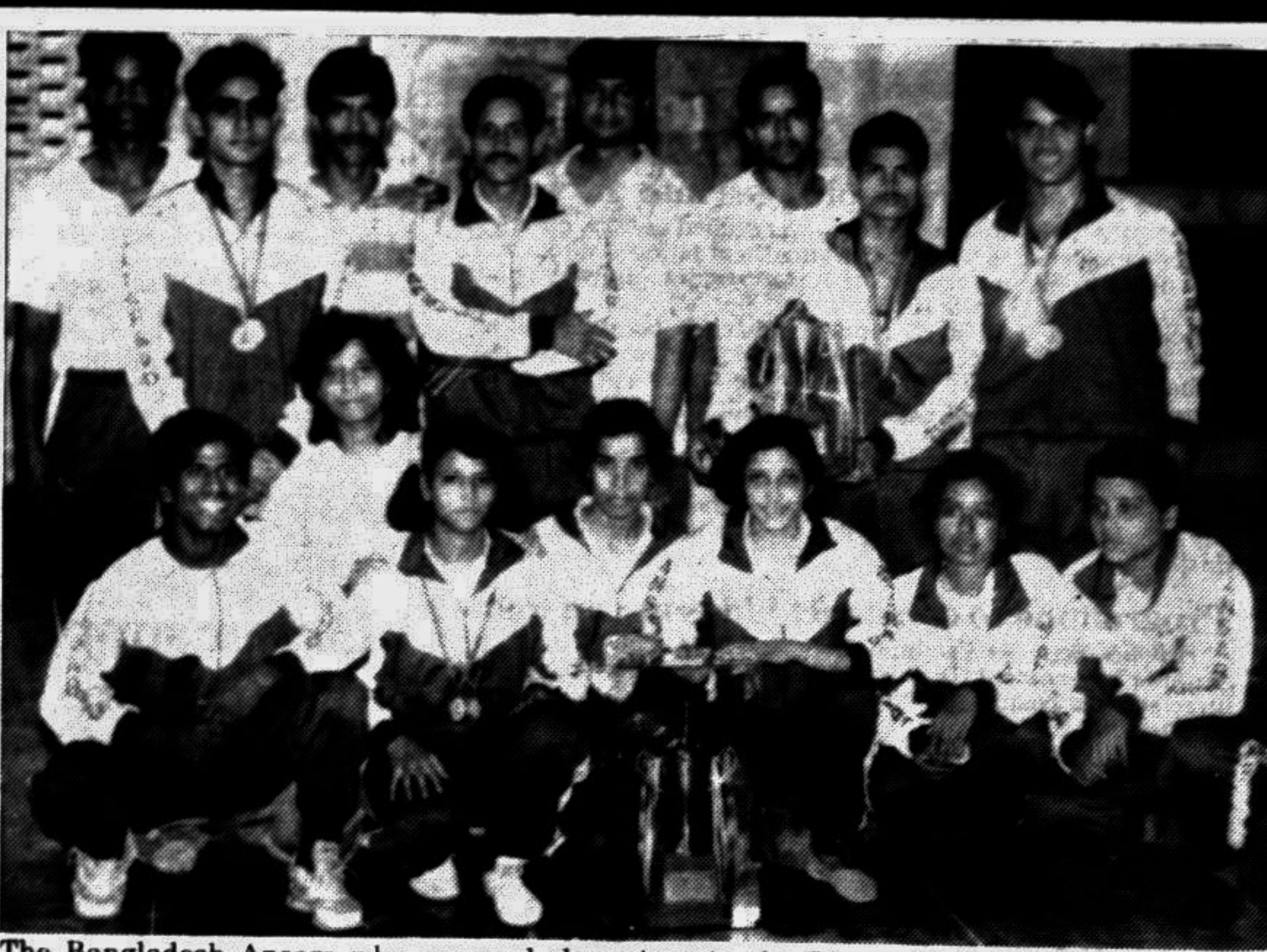
The Bangladesh Ansars who emerged champions in the Biman 23rd national gymnastics championships yesterday.

Sports Reporter Federation Cup champions Abahani Krira Chakra yesterday expressed their reluctance to play their second round away leg match of the Asian Cup Winners' Cup against Beijing Guoan. The popular Dhammondi outfit, who were scheduled to leave for the Chinese capital tomorrow, in a letter to the Bangladesh Football Federation (BFF) last night attributed non-availability of funds as the main reason behind cancellation of the trip. Earlier, both BFF, the governing body of local football, and country's ruling sports authority National Sports Council (NSC) had promised Abahani to provide with necessary financial assistance for the tour. Abahani, who went down fighting by a lone goal against the professional Chinese team in their home match at the Mirpur Stadium on Thursday, were scheduled to play the away match on October 4 in Beijing. Meanwhile, a cancellation of Abahani's trip to China means the BFF would have to pay a minimum penalty of US $5,000 dollars to the Asian Football Confederation (AFC).