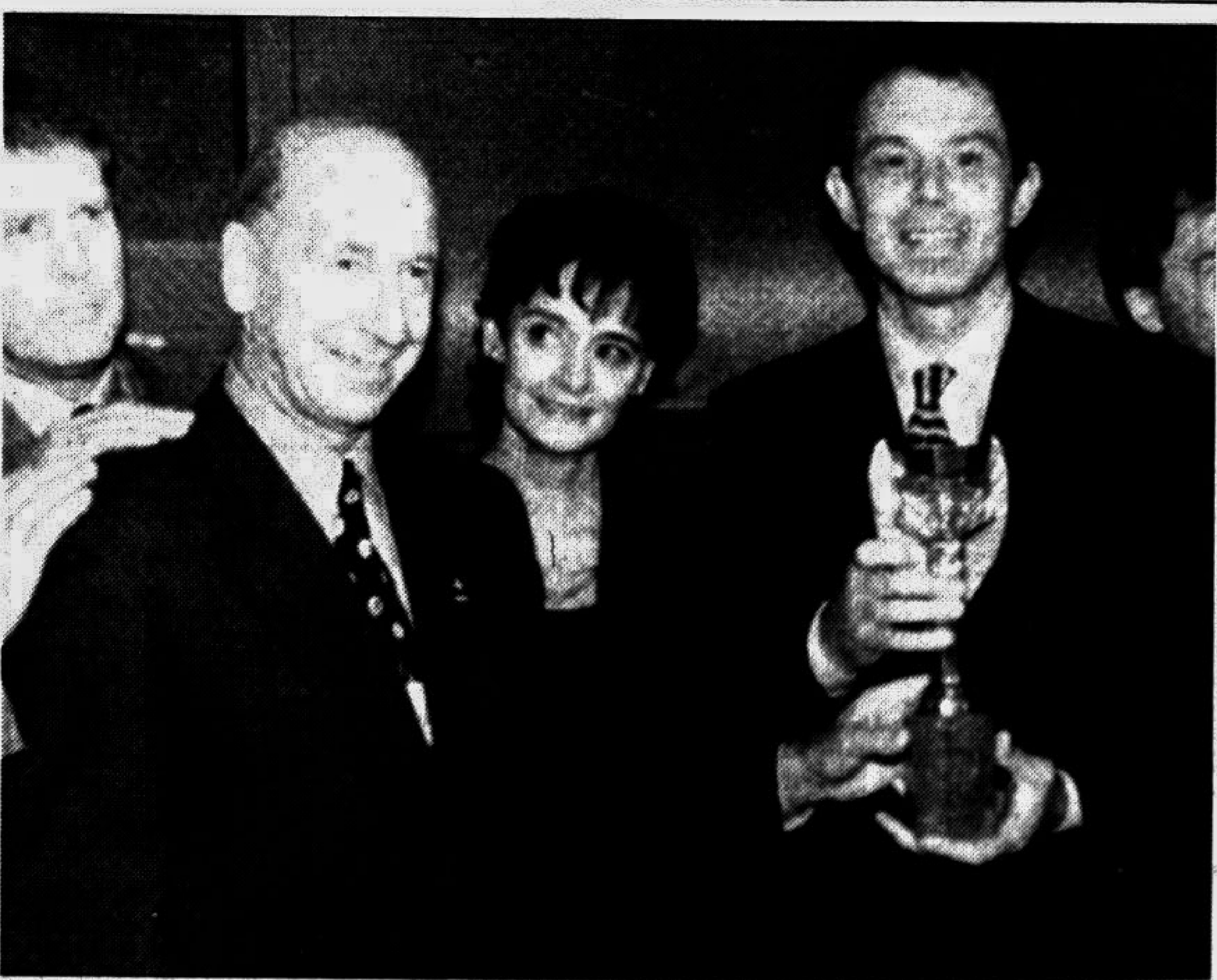
English football legend Bobby Charlton (2nd from left) and British Prime Minister Tony Blair hold the replica of Jules Rimet trophy during a reception arranged by the organisers of England's bid to host the 2006 World Cup.