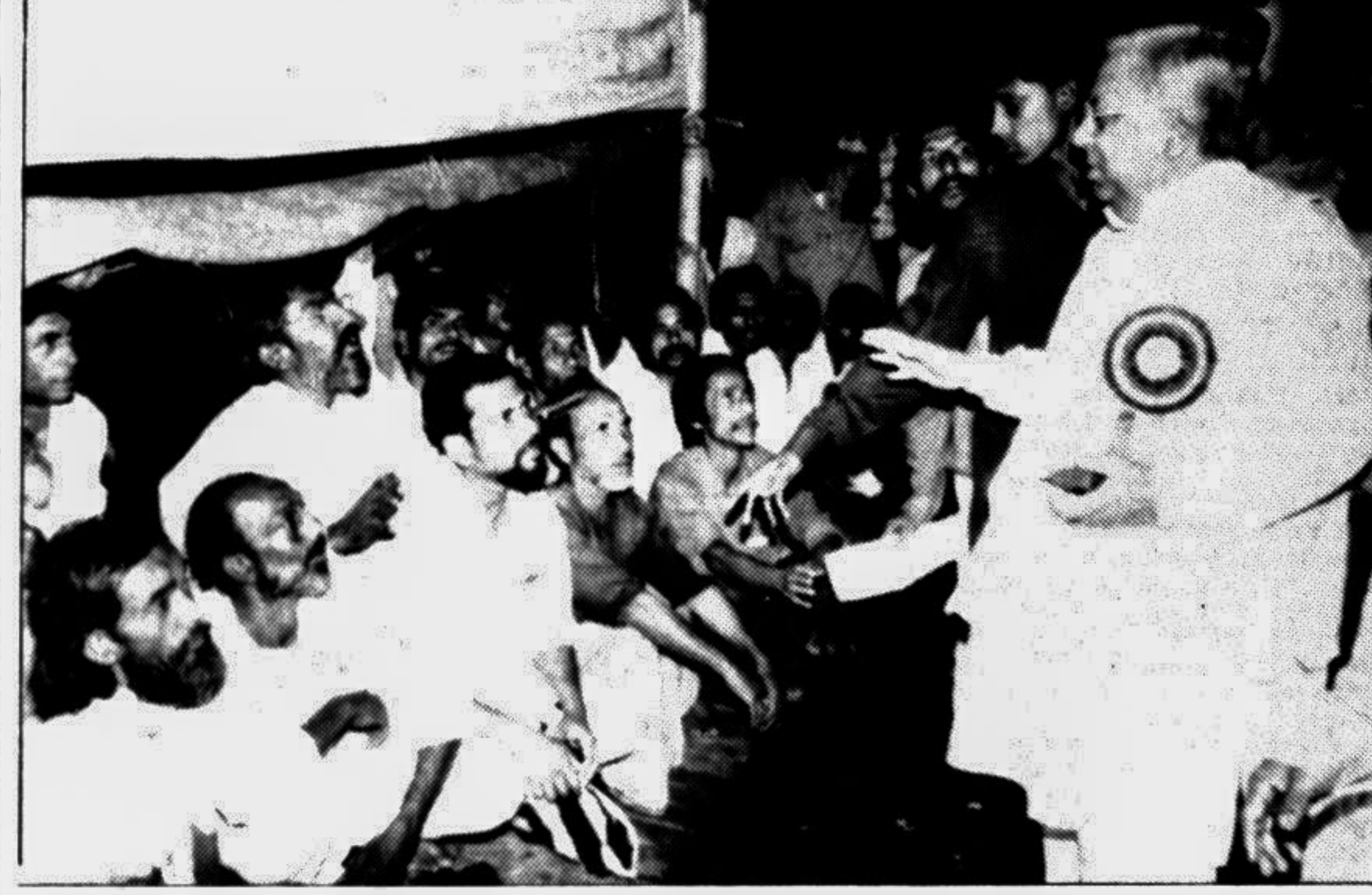
Speaker Humayun Rasheed Chowdhury yesterday talking with destitute freedom fighters who have been staging a sit-in demanding rehabilitation in front of the Jatiya Press Club for 15 days.

Bangladesh Apparel and Textile Exposition (BATEXPO) '97 will begin tomorrow at Hotel Sonargaon in the city.