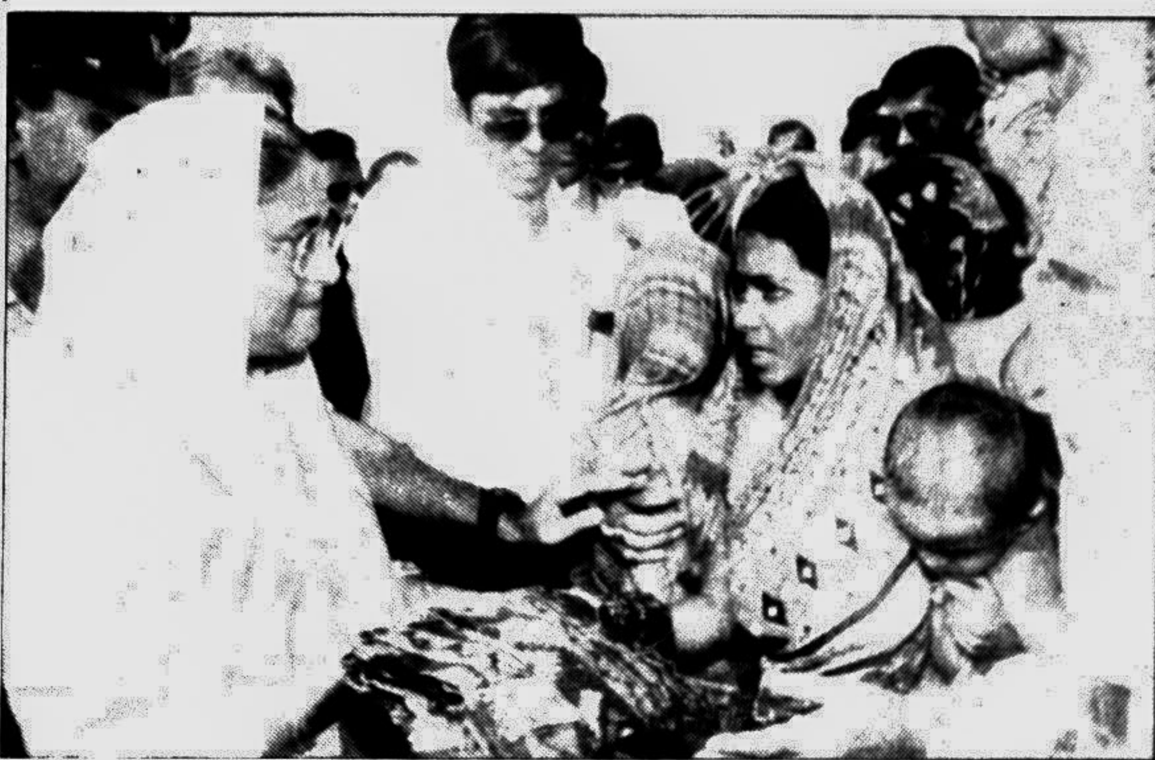
Prime Minister Sheikh Hasina distributing relief among cyclone affected people at Charbhuta union of Bhola district yesterday.

PLEASE CONTACT: BANGLADESH AIR EXPRESS INT'L LTD. Head Office: 9565114. Fax: 9565112. Gulshan: 887771. Chittagong: (031) 712127. Khulna: (041) 725008