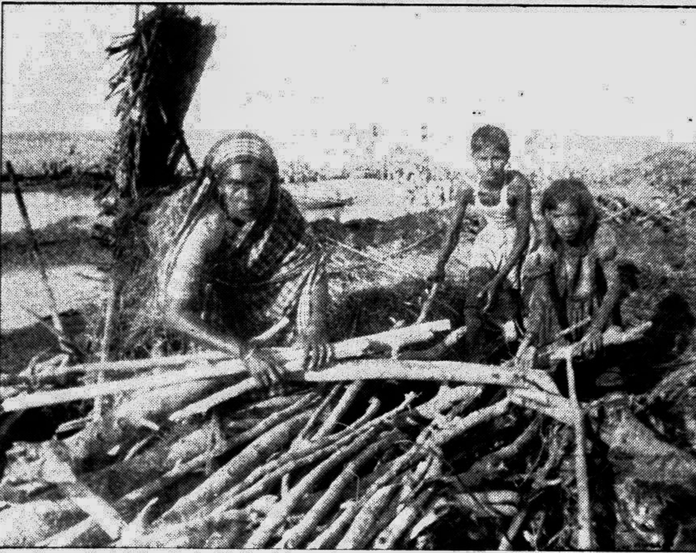
A cyclone affected family in Bhola picking through the rubbles of their house yesterday.