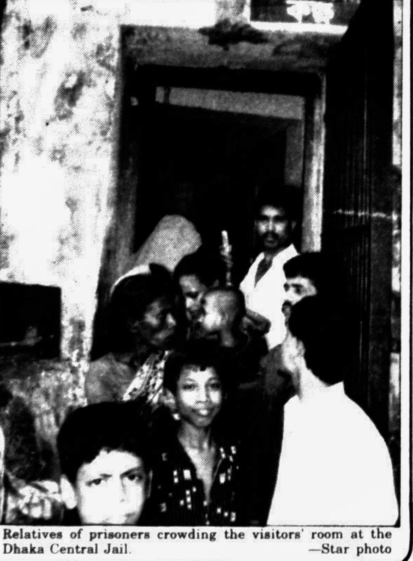
Relatives of prisoners crowding the visitors' room at the Dhaka Central Jail.