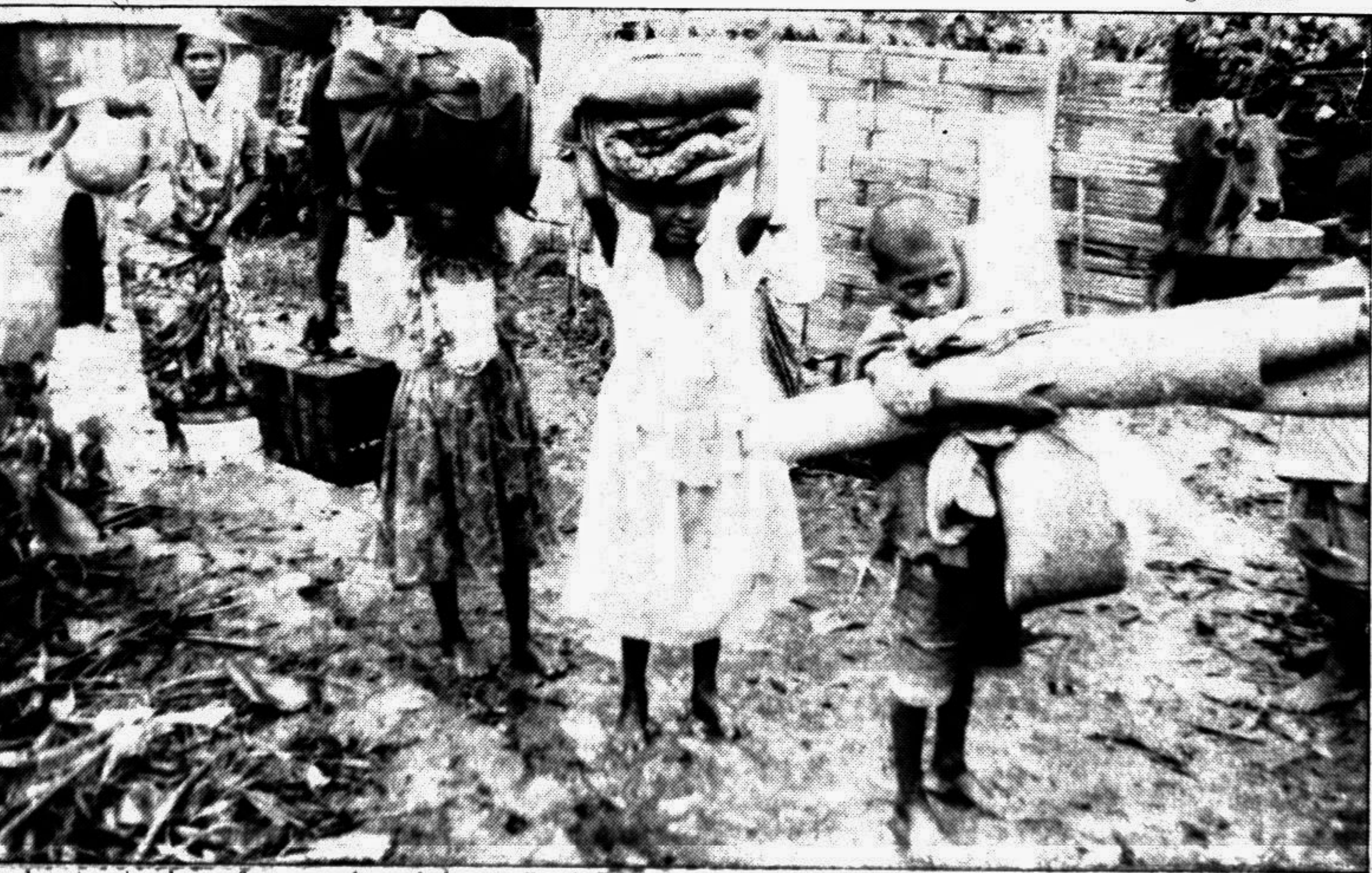
People returning home from a cyclone shelter in South Patenga after the storm subsided yesterday.