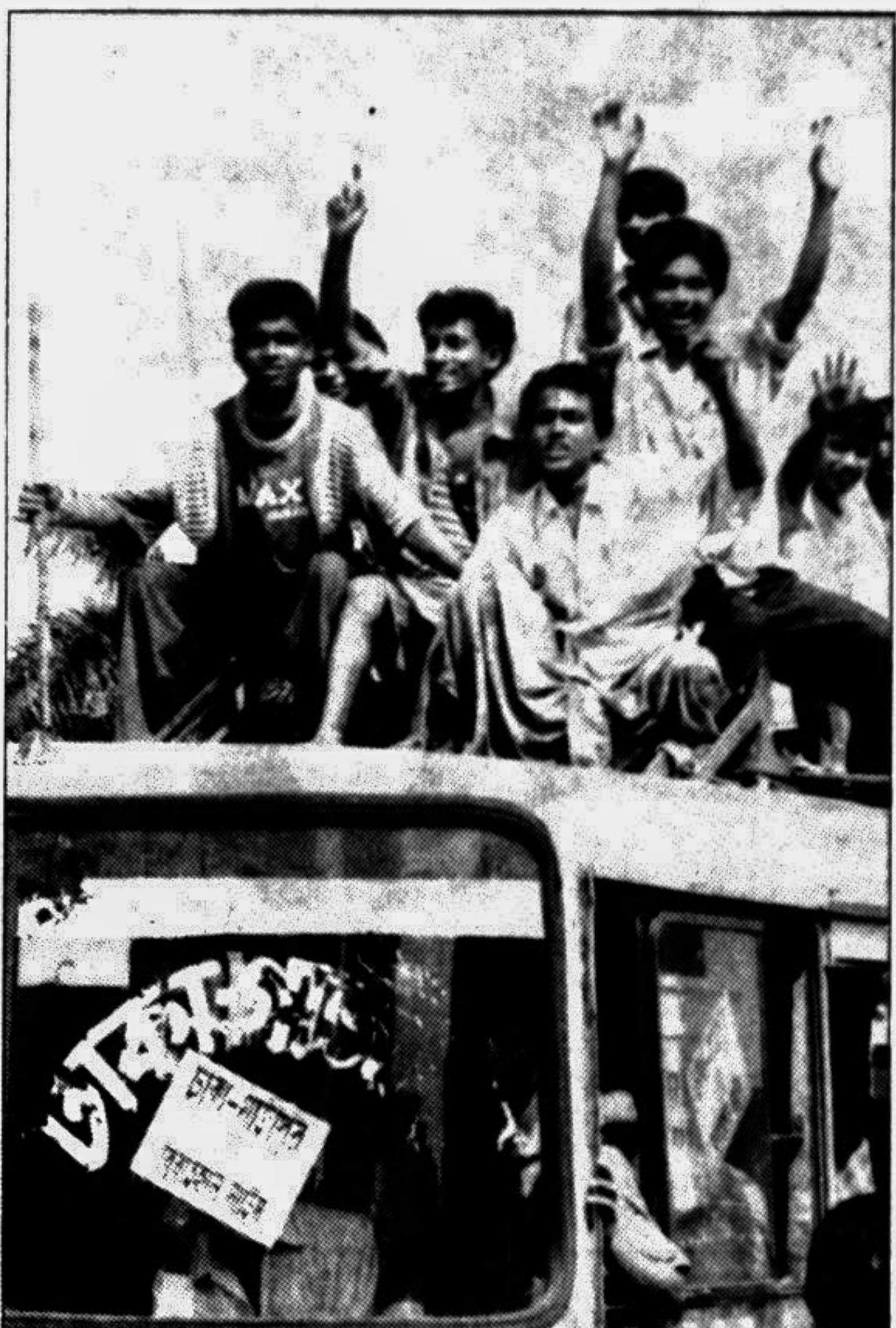
A minibus carrying anti-hartal activists in the city yesterday.

In the capital at least 20 people were injured, five of them admitted to DMCH. Police lath-