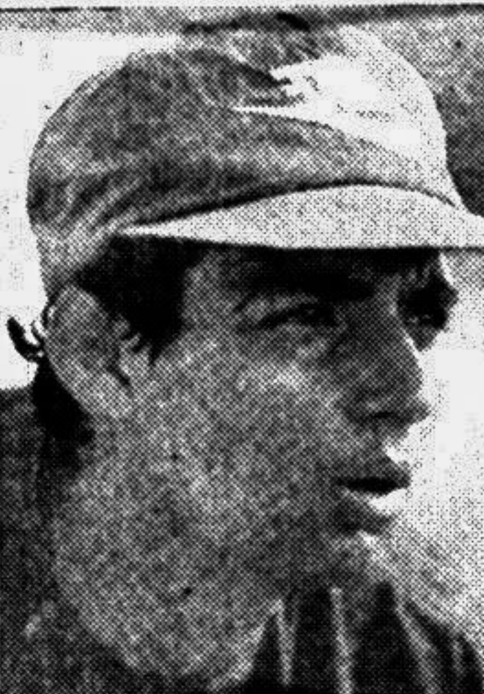
Ajay Jadeja (Indian cricket vice-captain) 'If you go to a disco after losing, people say these guys were paid to throw away the match, now they are partying.'

On fans' psychology after match-fixing charges brought against Indian cricketers.