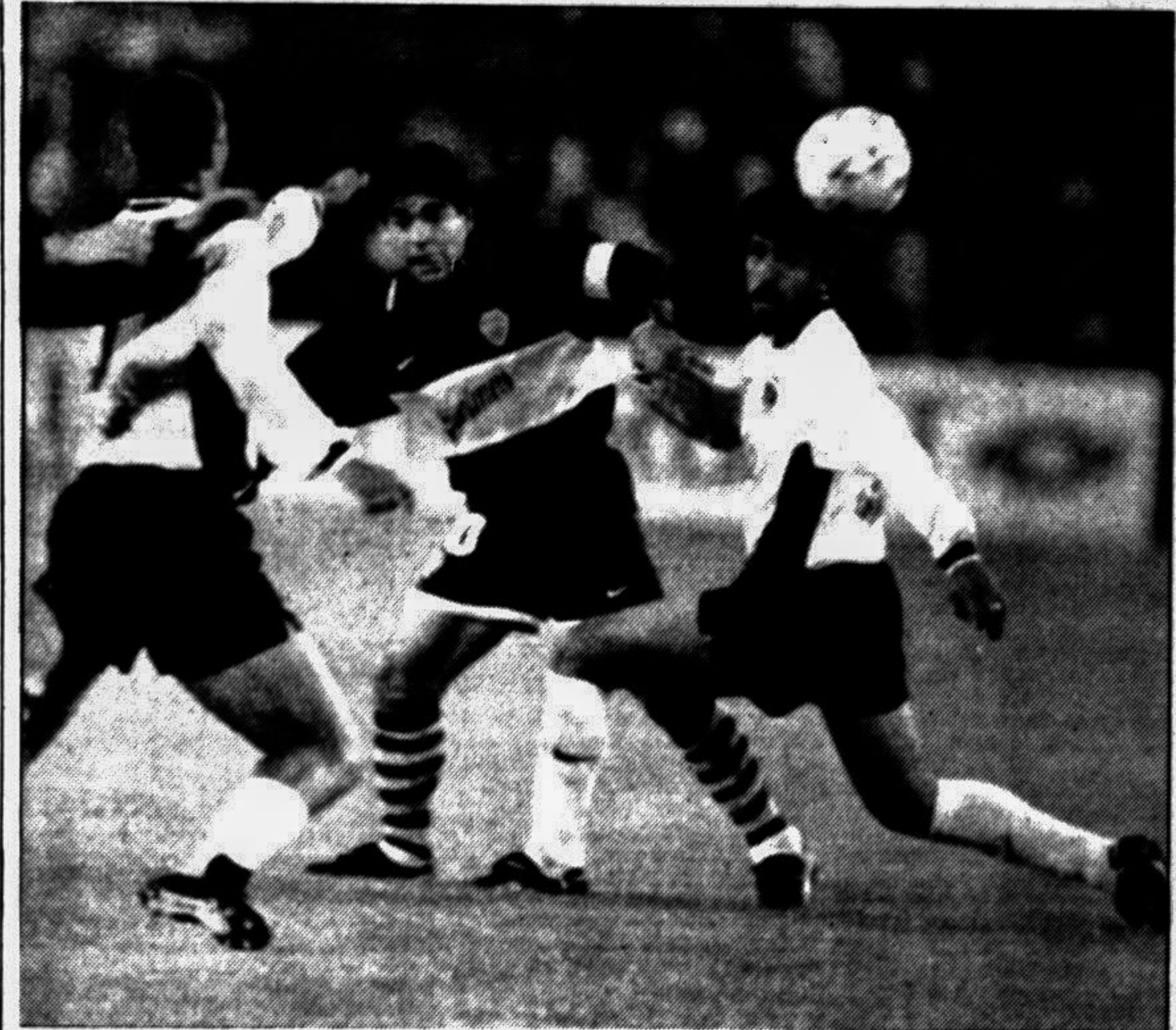
Diego Maradona (C) of Boca Juniors struggles to break through the defence wall of the Colo Colo during the Supercup match in Santiago on Sept 24. Boca lost their away engagement to the Chilean club 2-1.

Malta are still searching for their first point after nine games but the Czechs, who now have 13, can leapfrog Slovakia and finish third if they beat their neighbours in their last game. That is on October 11, when all the European groups will be settled.