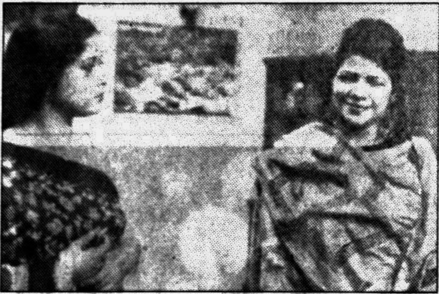
Drama serial Aatit on Tuesday

Friday 10:35 am Aapen 3:00 pm Jaiya 5:30 pm Film show: Moharaj's Daughter 7:25 pm Melancha 8:45 pm Drama of the week: Dhaas , written by Abdulla al Mamoon, central characters played by Abul al Mamon and Ferdousi Majumdar. Storyline: The protagonist is an idealistic man and want to lead his life according to his beliefs. But his dream to create a society of his dream gets stumbled. Nobody from his family rallies behind him in his pursuance of an honest life. His beliefs are shattered and family pressure force him to embroil in corruption. But his conscience yes no. Finally he fights back. Saturday 2:20 pm Movie of the week: Iranian film Arus meaning Bride. 8:35 pm Binyog 9:00 pm Film show: Flobocop Ghatnar Adalay 10:30 pm Sunday 3:45 pm Drama of the week (Repeat) 8:35 pm Band Show 9:00 pm Seai Gan Shunni: Songs from olden days 10:35 pm Film show: Herculas Monday 7:25 pm Bansharee featuring folk song 8:45 pm Package drama 10:35 pm Shilpalok: Programme on recitation 11:00 pm Comedy series: Sinfield Tuesday 3:20 pm Drama series: Dynasty 8:30 pm Swadhinata Tomar Janya 9:00 pm Drama serial: Aatit 10:35 pm Soor Jhankar