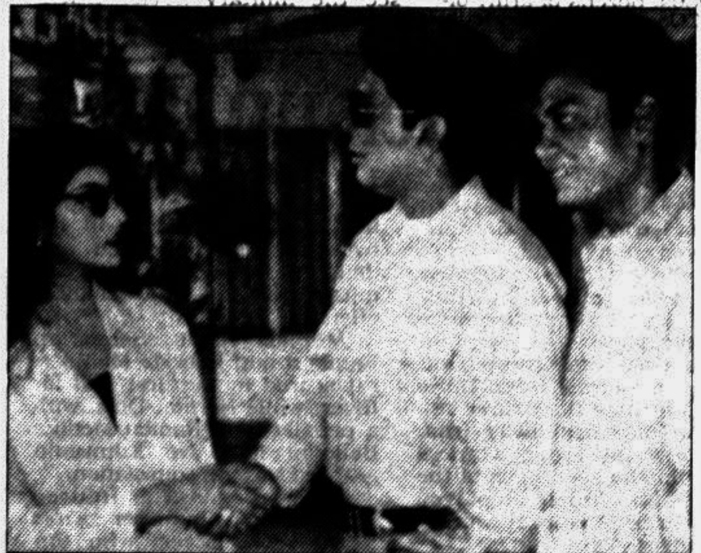
Scene from Hathat Bristi