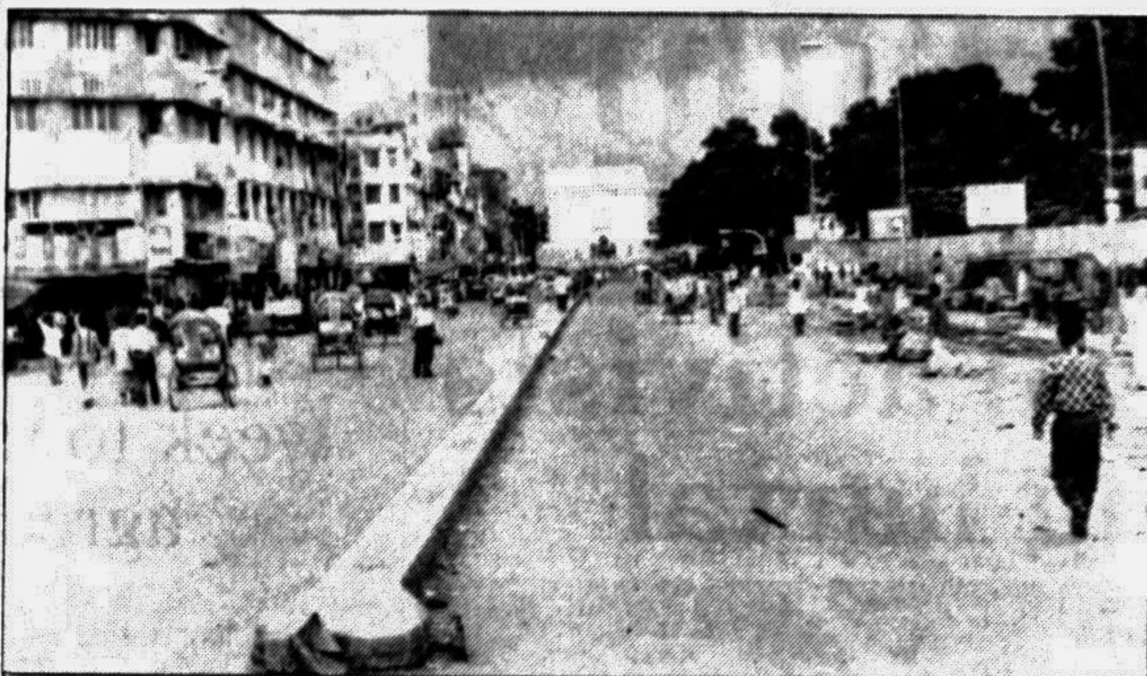
Gulistan area during yesterday's hartal hours.