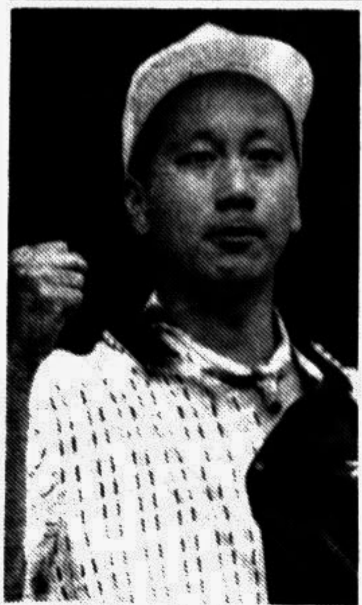
Michael Chang (World No 2 tennis player) You can't expect a cake walk in any round.