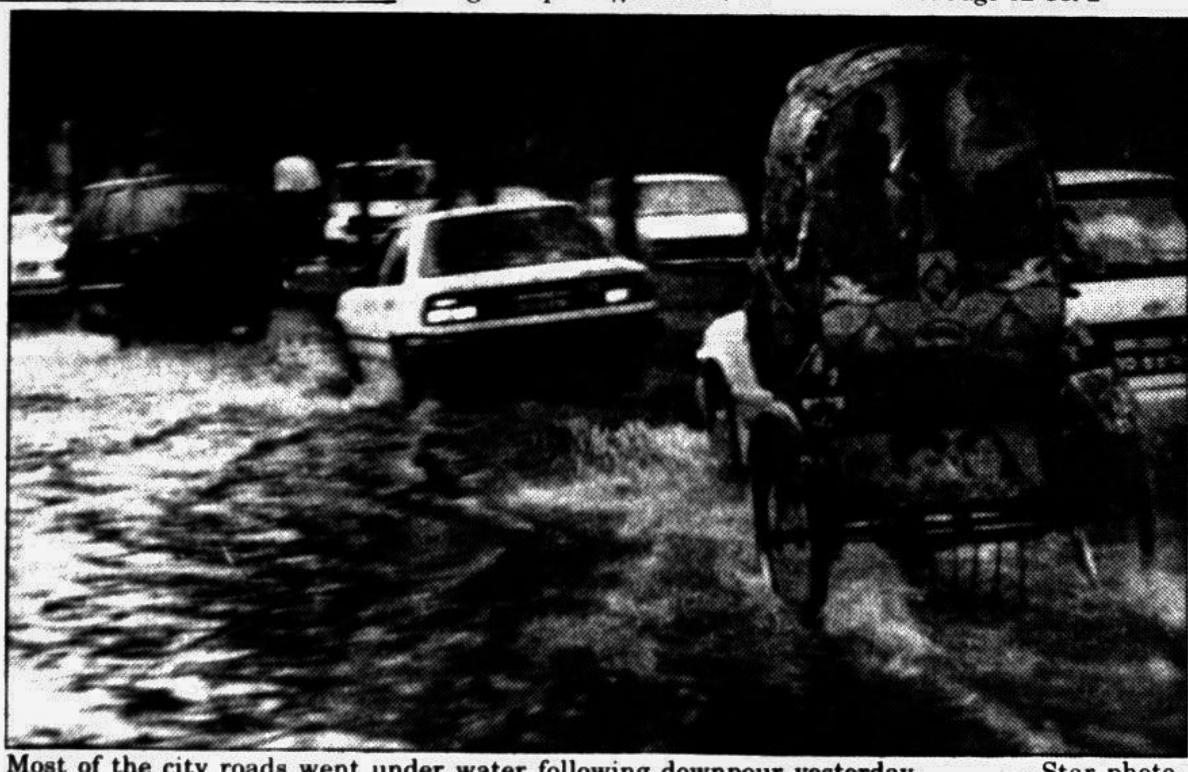
Most of the city roads went under water following downpour yesterday.

Residents of old Dhaka complained of dirty drains overflowing onto the streets and alleys, leaving the evening air foul with the smell of rubbish. See Page 12 Col 2