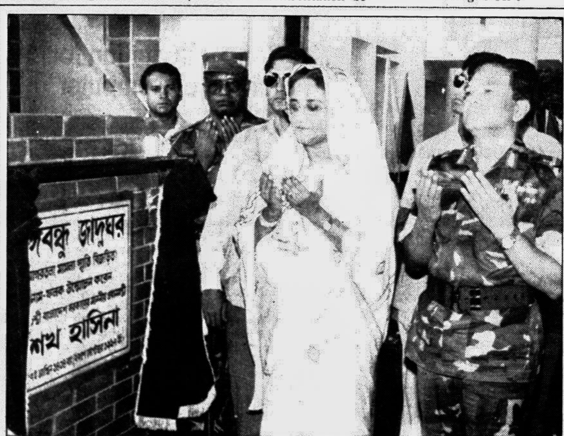
Prime Minister Sheikh Hasina offering munajat after unveiling the plaque of Bangabandhu Museum at Dhaka Cantonment yesterday.

tween the authorities and the main opposition party, BNP, since Thursday over the issue of holding rallies on the streets. Earlier on Sunday, prior to the violent clash between police and BNP supporters in front of their central office on the issue BNP Chief and Leader of the Opposition Begum Khaleda Zia lodged a complaint to the President in this regard at Bangabandhu. The President made some suggestions to the state minister for improvement of the— See Page 8 Col 4