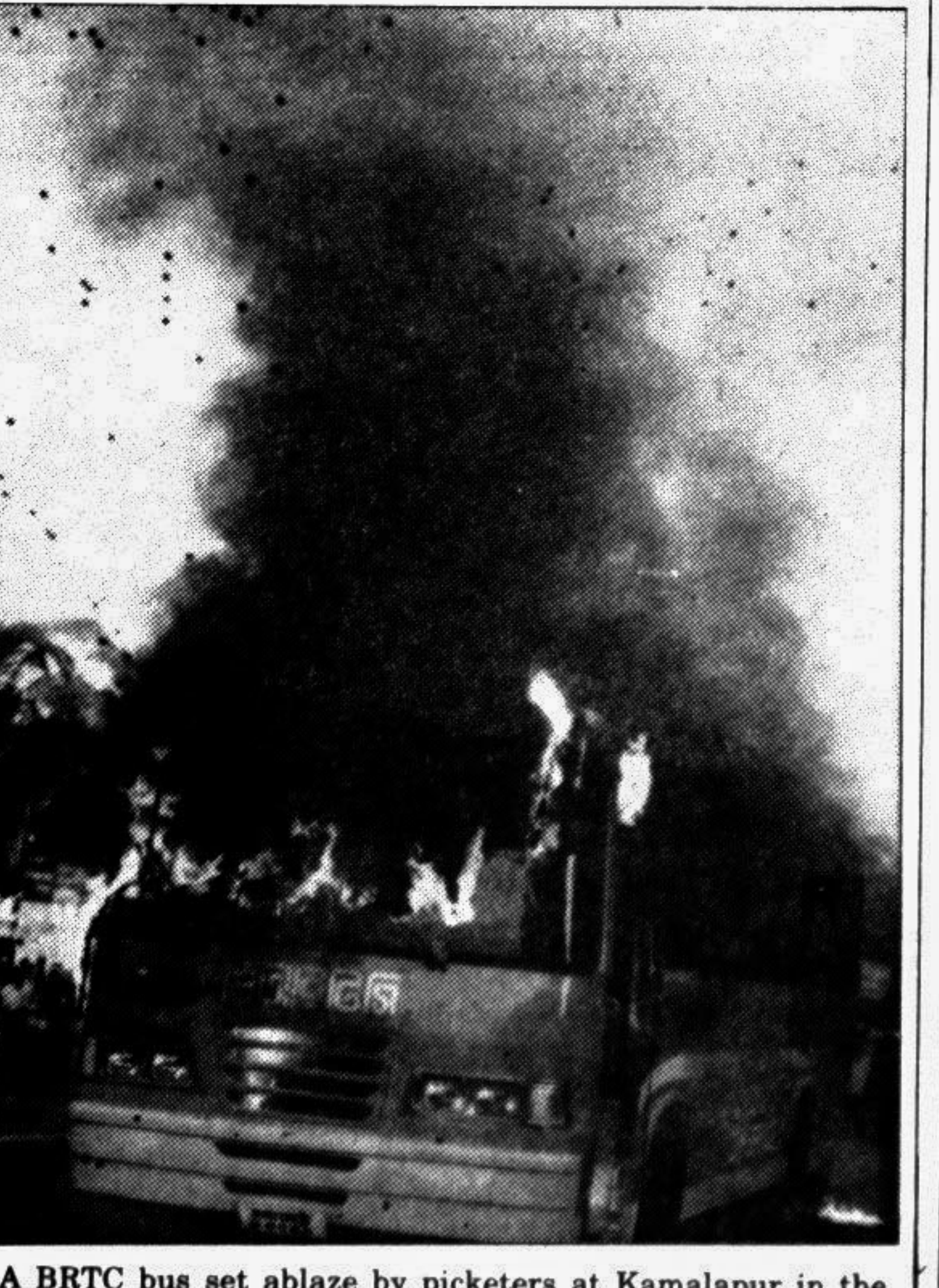
A BRTC bus set ablaze by picketers at Kamalapur in the city during BNP's 'protest day' yesterday.