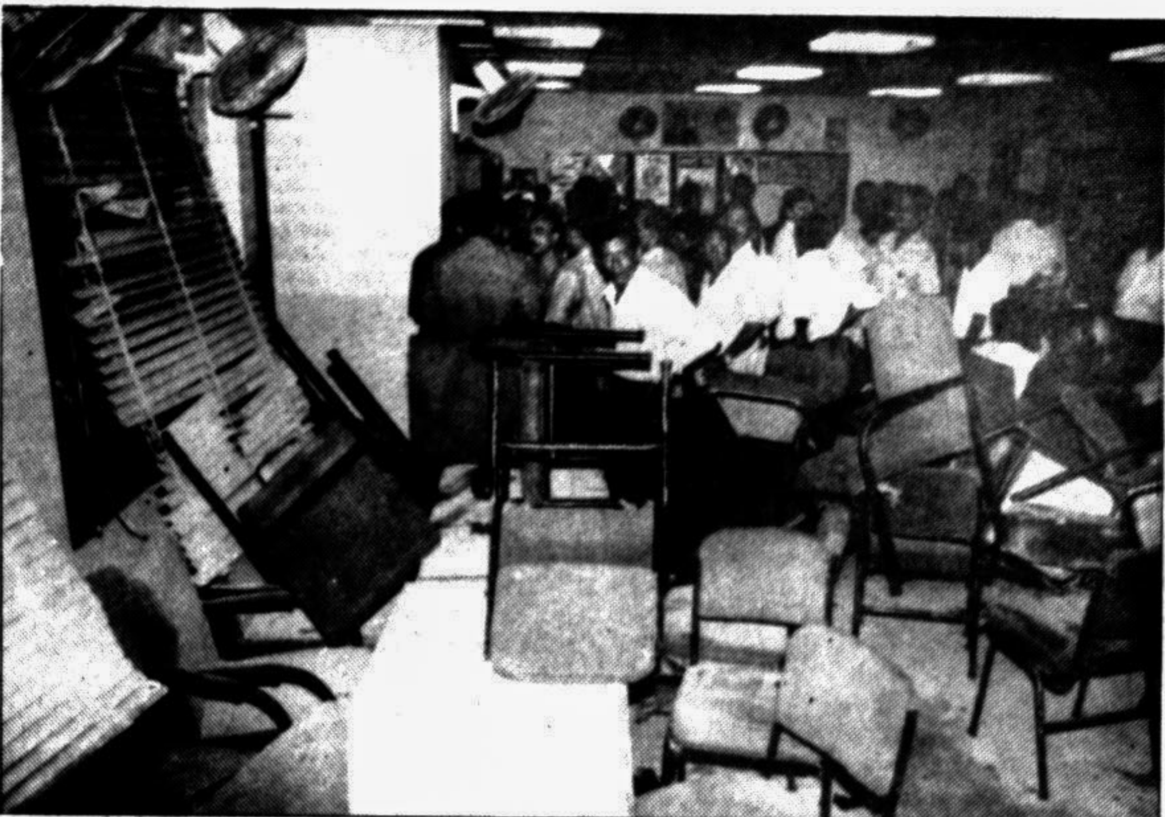
The office room of BNP-backed CBA at the DESA office behind the Jatiya Press Club was ransacked yesterday.