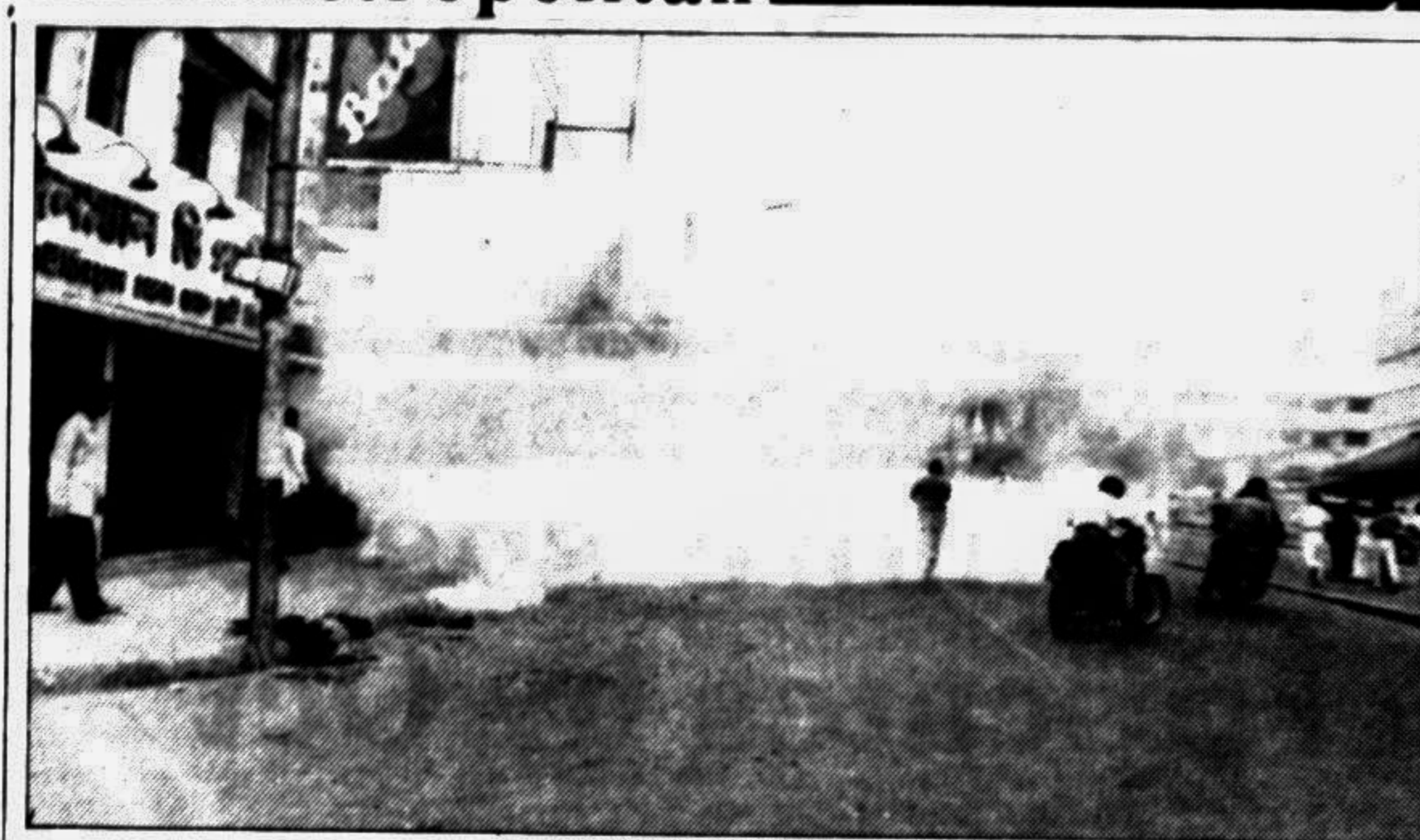
Police lobbed tear gas shells to disperse Jemaat-e-Islami activists from in front of the Secretariat building in the city yesterday.