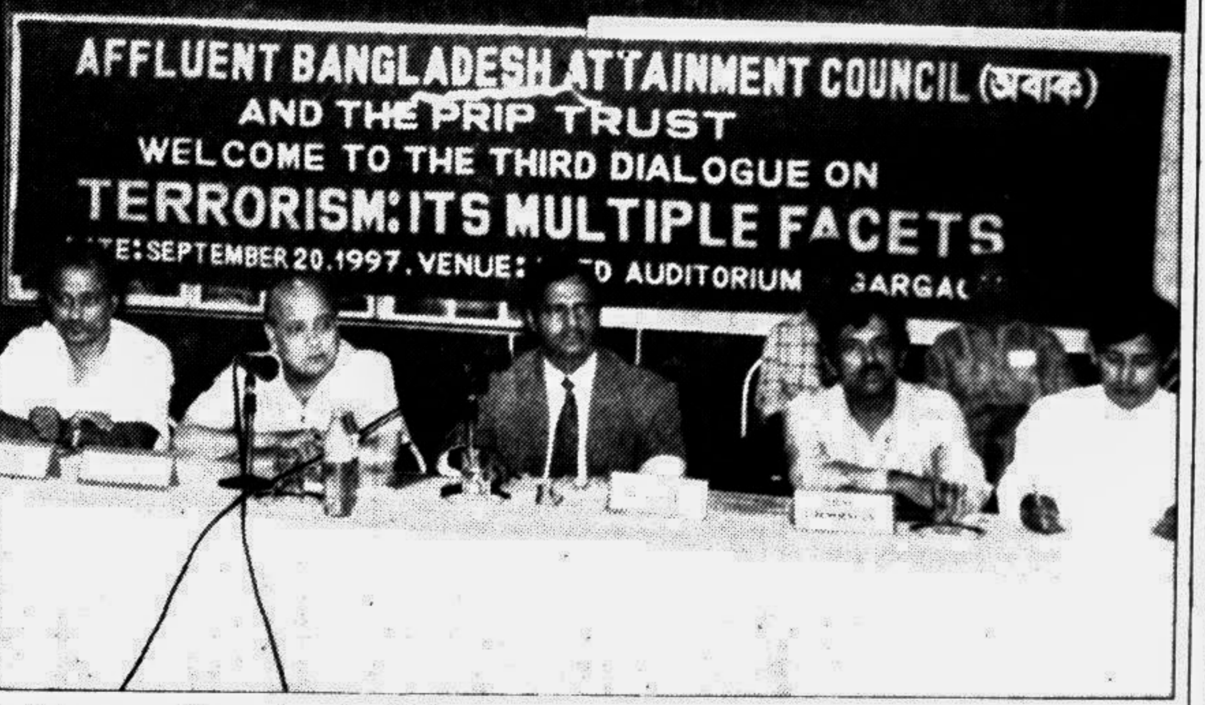
A dialogue on 'Terrorism: Its Multiple Facets', organised by Affluent Bangladesh Attainment Council and Prip Trust, was held in the city yesterday. Home Minister Rafiqul Islam (C) was the chief guest.

Light to moderate rain or thundershowers with temporary gusty wind may occur at many places over Sylhet, Dhaka and Rajshahi divisions, and at a few places over Barisal, Chittagong and Khulna divisions during the next 12 hours till 6 pm today, reports UNB. The Met Office said no appreciable change in day temperature is expected over the country during the period. The country's highest temperature was recorded 34.3 degree Celsius at Chittagong and the lowest 23 degrees at Rajshahi. The sun sets today at 5.56 pm and rises tomorrow at 5.47 am.