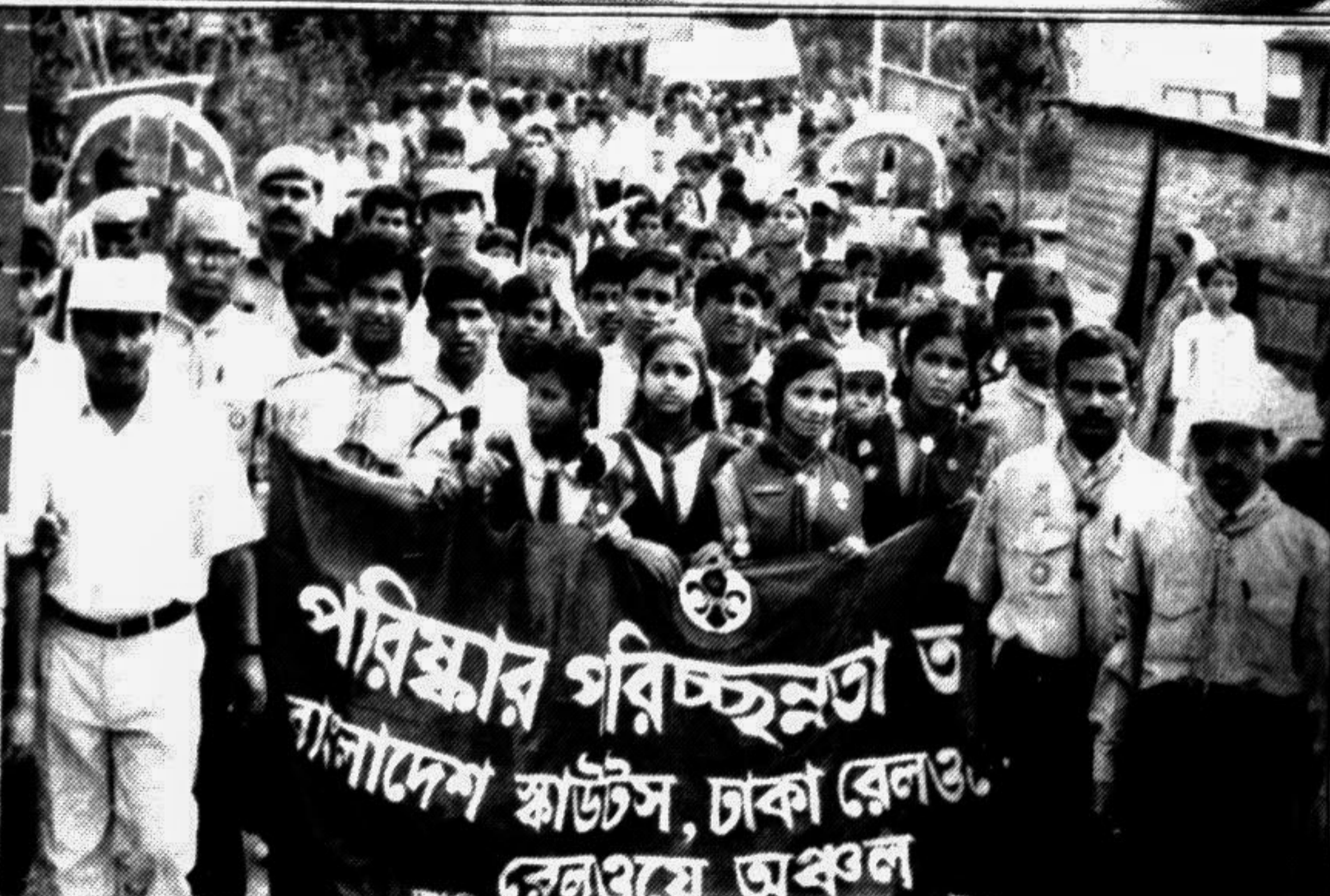
Schoolboys and girls picked up brooms, baskets and spades, collecting garbage and visiting homes, to resume the Save Dhaka, Clean Dhaka campaign yesterday. They moved from house to house urging residents in the city's Shahjahanpur area to keep their neighbourhoods clean. The Dhaka Railway District Scouts arranged it as part of the campaign launched last year jointly by The Daily Star, Bangladesh Scouts, Bangladesh University of Engineering and Technology (BUET) and the Directorate of Youth.