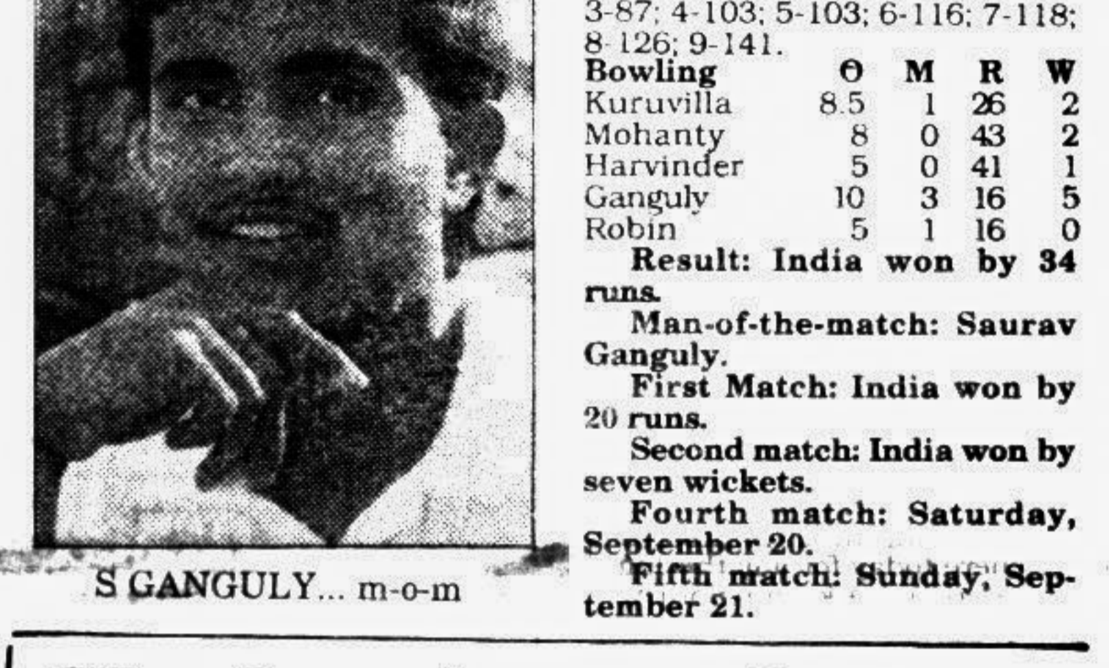
S GANGULY... m-o-m

PAKISTAN Anwar c Dravid b Mohanty 22 Afridi c Tendulkar b Kuruvilla 44 Raja c Ganguly b Harvinder 11 Izai c sub (Kambli) b Ganguly 13 Malik c Tendulkar b Ganguly 6 H Raza c Jadeja b Ganguly 0 Moin c Robin b Ganguly 7 Saqain c Mohanty b Kuruvilla 11 A Mehmood c Saba Karim b Mohanty 6 Aaqib c Kuruvilla b Ganguly 11 M Akram not out 15 Extras: (lb-6, w-4, nb-5) 12 Total: (All out in 36.5 overs) 148 Fall of wickets: 1-52; 2-79; 3-87; 4-103; 5-103; 6-116; 7-118; 8-126; 9-141. Bowling: O M R W Kuruvilla 8.5 1 26 2 Mohanty 8 0 43 2 Harvinder 5 0 41 1 Ganguly 10 3 16 5 Robin 5 1 16 0 Result: India won by 34 runs. Man-of-the-match: Saurav Ganguly. First Match: India won by 20 runs. Second match: India won by seven wickets. Fourth match: Saturday, September 20. Fifth match: Sunday, September 21.