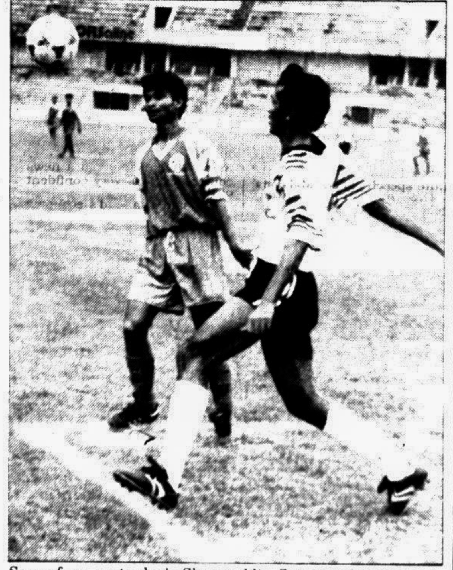
Scene from yesterday's Shamsuddin Spinning Mahanagari Cup clash between Mukhtijodha Sangsad and Arambagh KS at the Mirpur Stadium.

TODAY'S MATCHES Brothers Union vs Farashganj SC (3 pm) Abahani KC vs Rahmatganj MFS (6 pm)