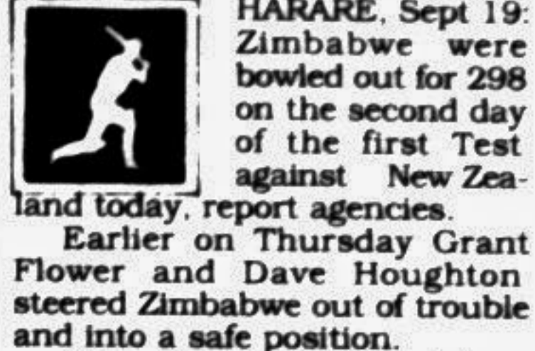
G FLOWER... 104

HARARE, Sept 19: Zimbabwe were bowled out for 298 on the second day of the first Test against New Zealand today, report agencies. Earlier on Thursday Grant Flower and Dave Houghton steered Zimbabwe out of trouble and into a safe position.