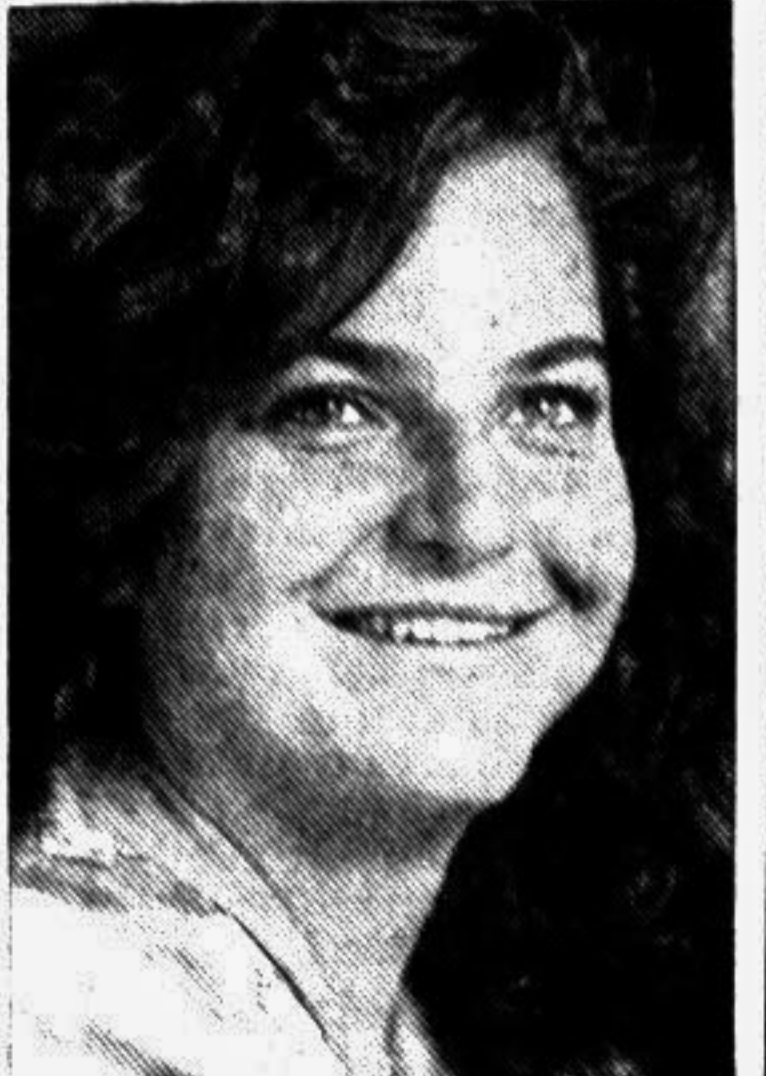
Arantxa Sanchez-Vicario (Spanish tennis player) "What's done is done, but life continues..."