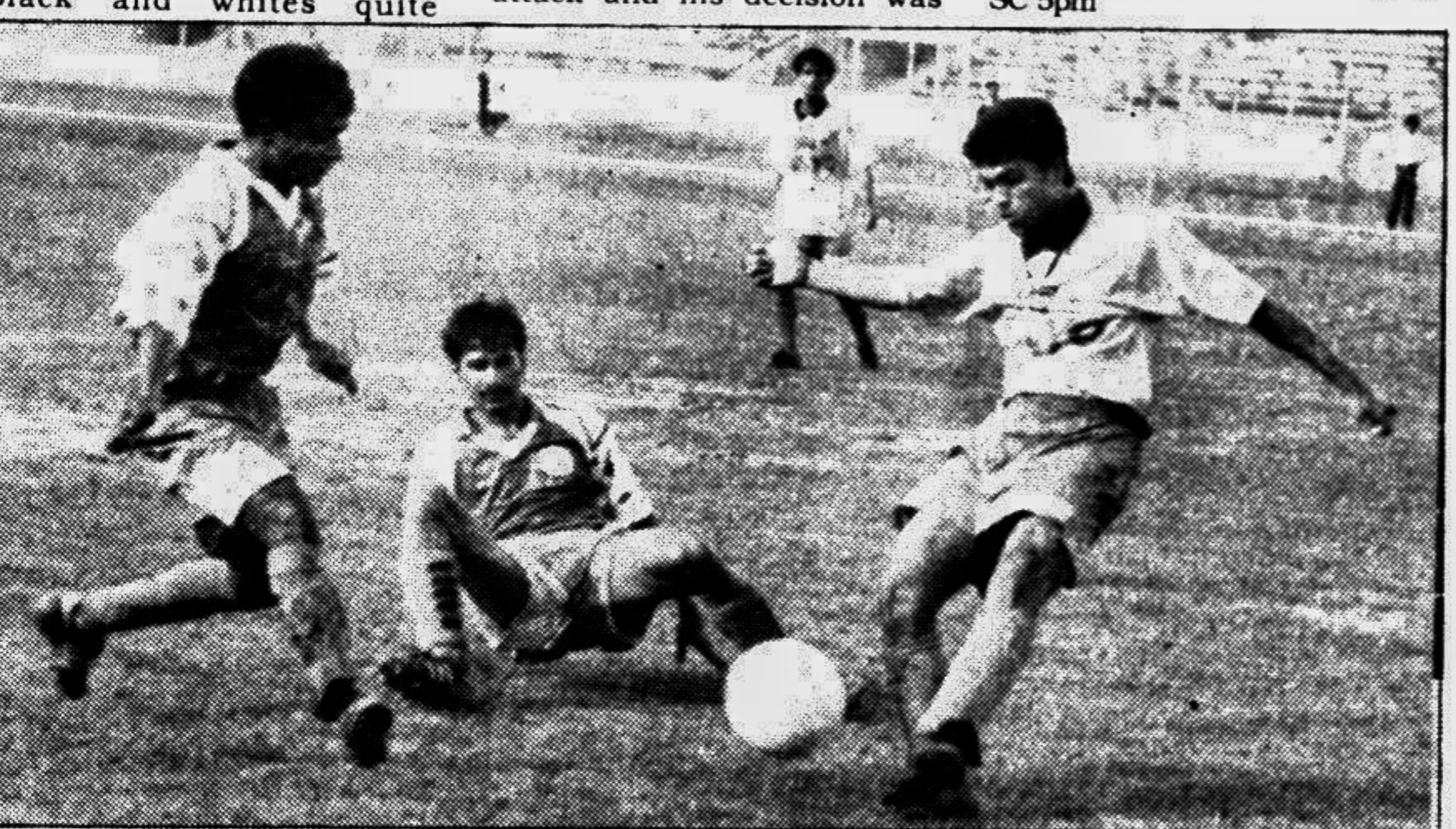
Action from yesterday's Shamsuddin Spinning Mahanagari Cup encounter between Muktojodha Sangsad and Youngmen's Club Fakirerpool at the Mirpur Stadium. Muktis won 1-0.