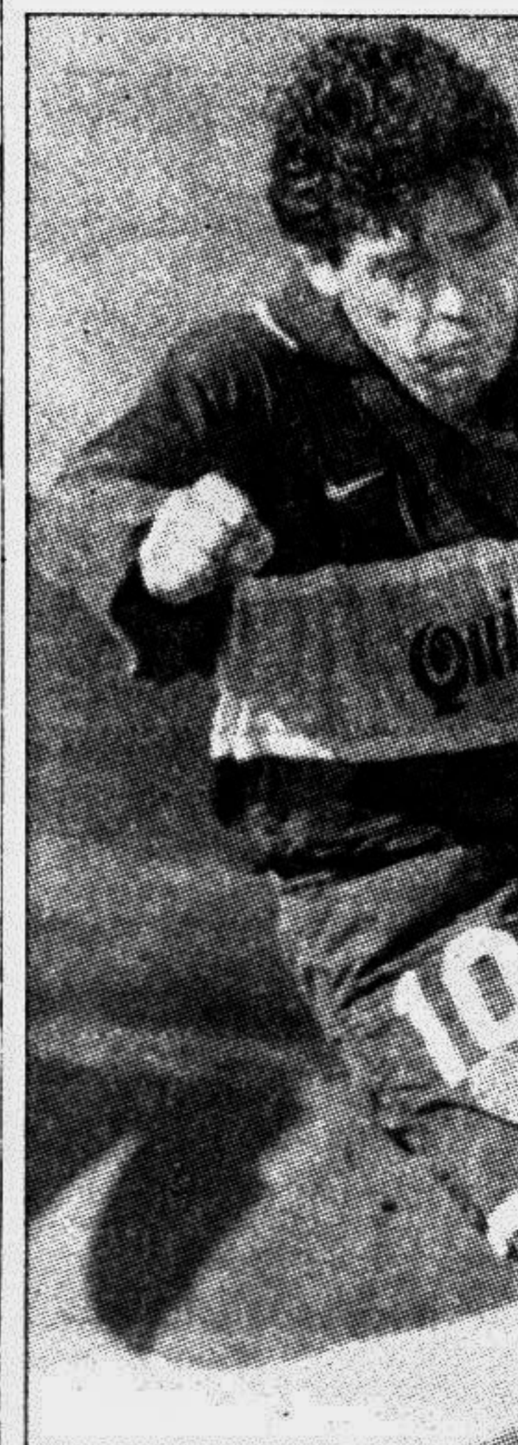
Boca Junior's Diego Maradona tries to bring the ball under his control during the encounter against Newell's Old Boys in Buenos Aires on Sept 14.

Maradona, who earlier in the day had categorically denied rumours that the match could be his last, converted a 42nd minute penalty to live up to a tedious encounter marred by crowd trouble.