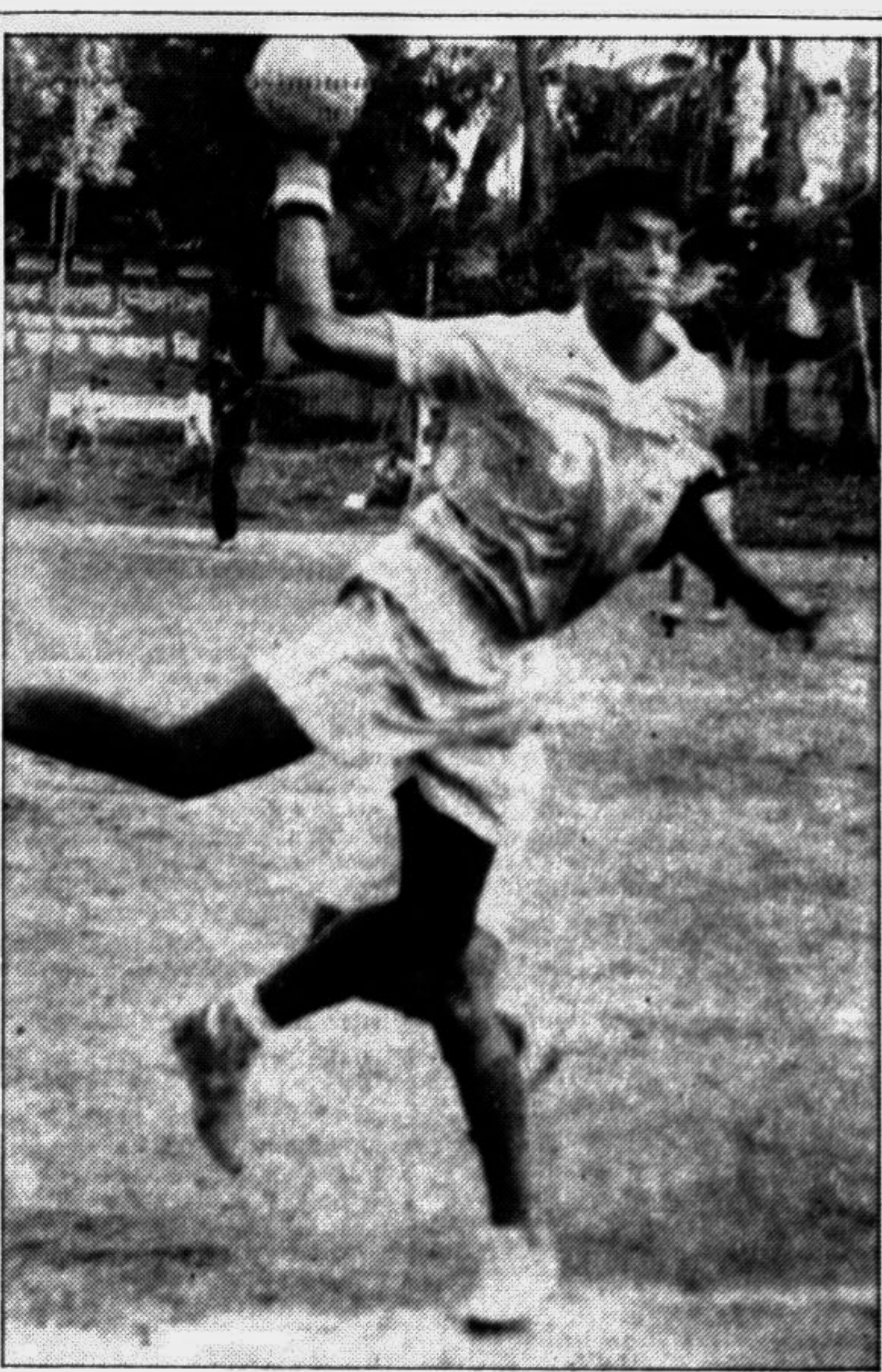
An unidentified Air Force man in action during the lone Cute First Division match against Christian Youth Club yesterday.

Series: India lead the 5-ODI series 2-0.