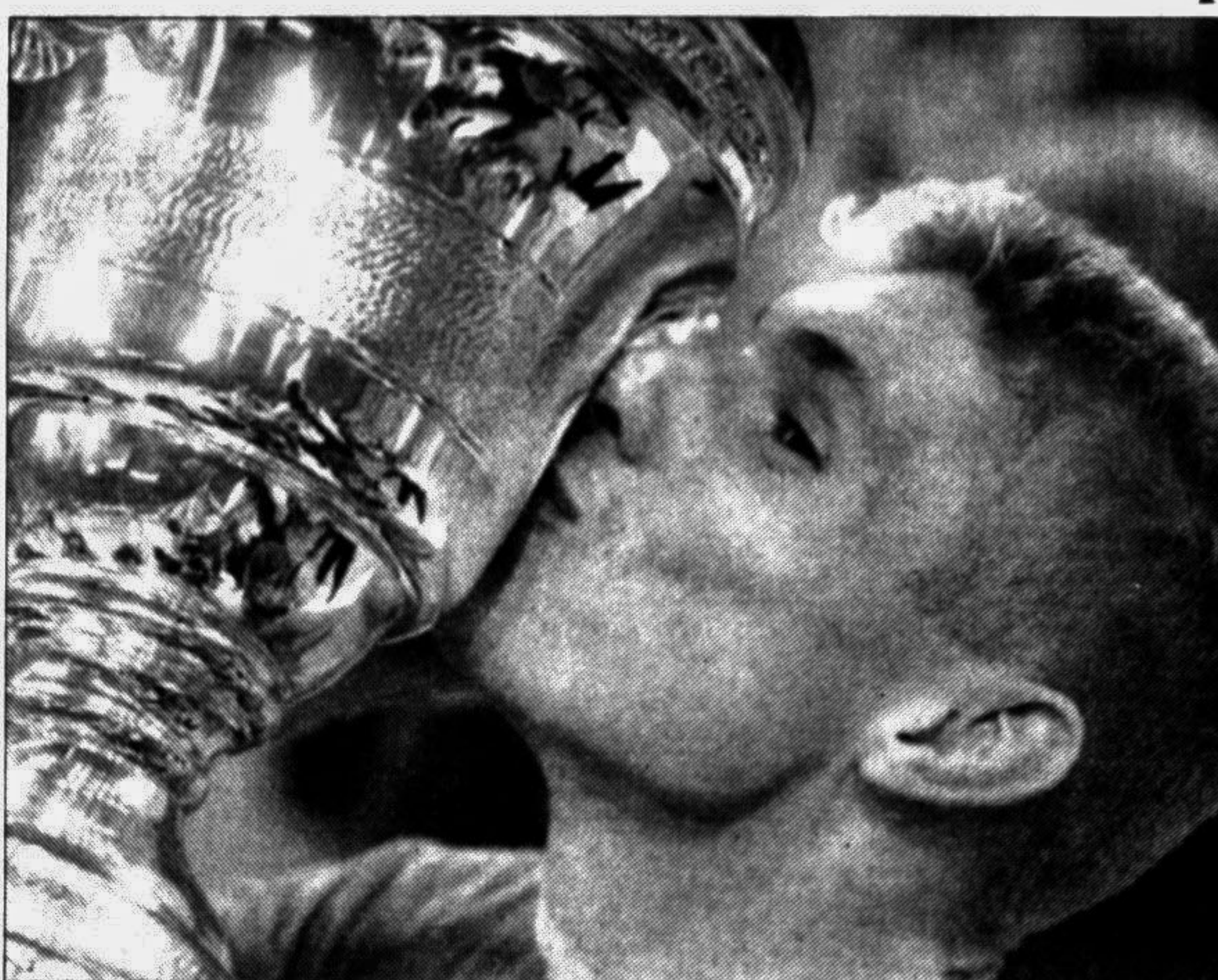
Dutch player Bas van de Goor kisses the trophy after his team defeated Yugoslavia in the final of the European Volleyball Championships on Sept 14. The hosts won 3-1.

(German tennis superstar) "Tennis is a passion. There are periods when I know what I have to do, but I always need some special inspiration to do my best."