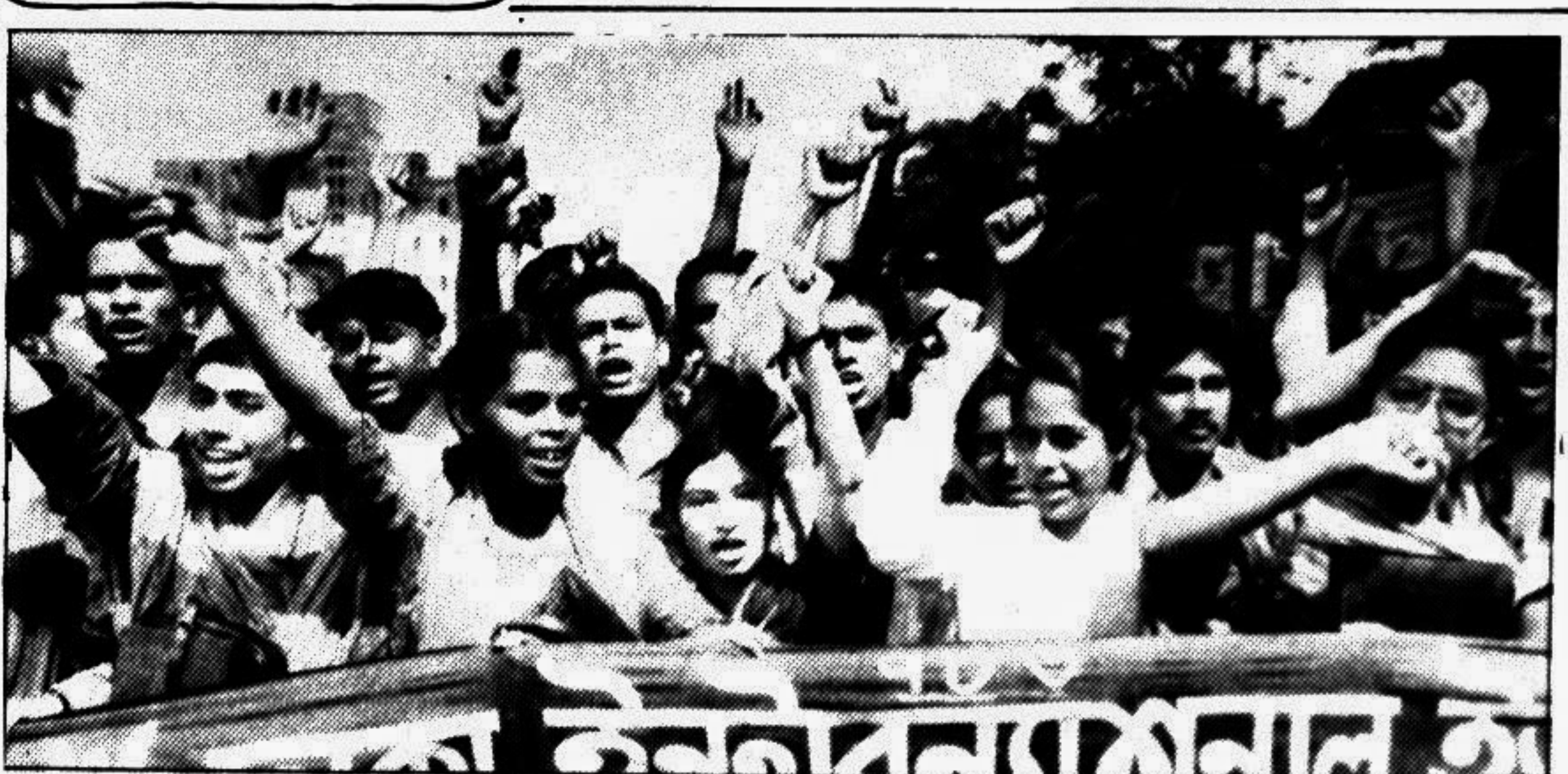
Students of Dhaka International University held a rally demanding recognition of the university in front of the Jatiya Press Club yesterday.