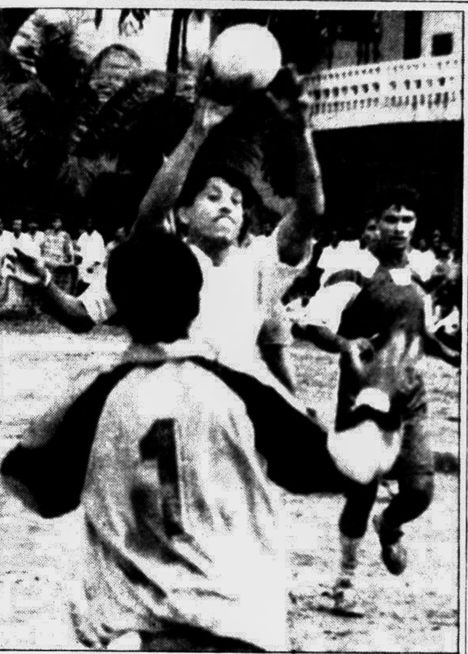
Action from yesterday's Cute First Division handball league encounter between Biman and Arambagh at the court near to Dhaka Stadium.

Meanwhile, the third place-deciding match between the two losing semifinalists — Pakistan and Sri Lanka — will be held prior to the final at the same venue. The match will commence at 12.45 BST.